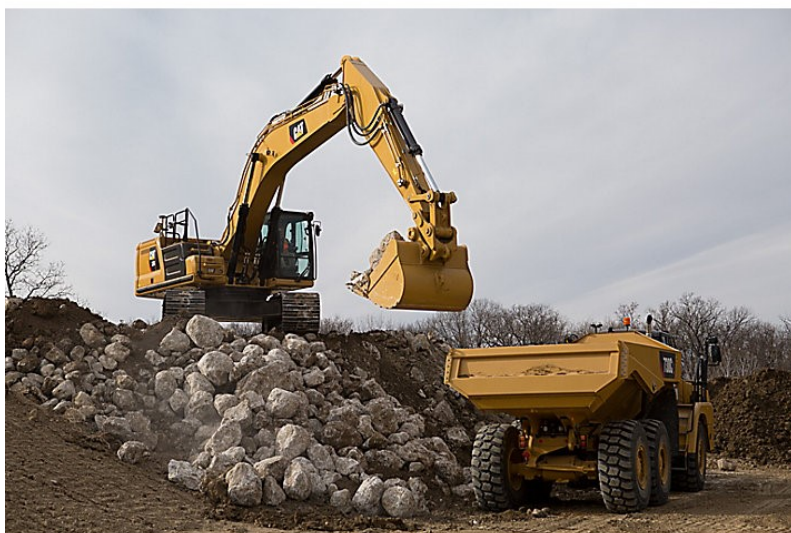
A Cat 336 excavator, as seen above, has an operating weight of 81,900 lbs and is capable of moving large amounts of debris.