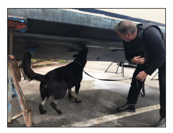
Kilo inspecting a mussel fouled watercraft from Michigan that as intercepted on September 24<sup>th</sup> at the Lower Mainland inspection station.