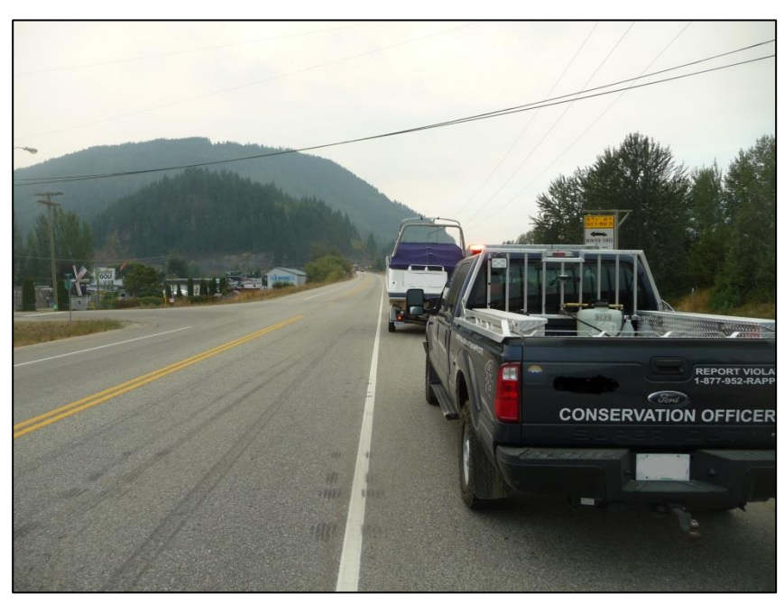
Conservation officer apprehending a high risk watercraft from Ontario that failed to stop at the Golden inspection station on August 30<sup>th</sup>.

Watercraft operators who fail to stop at an inspection station are being reported to the Report All Poachers and Polluters (RAPP) hotline and full time Conservation Officers are responding and following up.