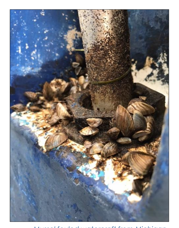
Mussel fouled watercraft from Michigan was intercepted at the Lower Mainland inspection station on Sep 24<sup>th</sup>.

Of the more than 35,000 watercraft inspected, 24 were confirmed to have adult invasive mussels. These came from Ontario (14), Michigan (2), Texas (2), Quebec (2), Arizona (1), Ohio (1), Illinois (1), and New York (1); and were destined for the Lower Mainland (11), Okanagan (7), Vancouver Island (3), Kootenays (1), Thompson-Nicola (1) and Alaska (1). The Program received advanced notification on 20 of the 24 mussel fouled boats either from another jurisdiction or by Canada Border Services Agents (CBSA). For two of the boats the owners contacted the Program in advance to arrange for inspection when they arrived in BC.