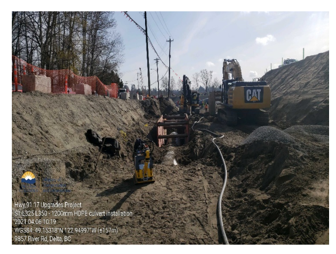
S3: 1200mm HDPE culvert installation. Taken April 6, 2021