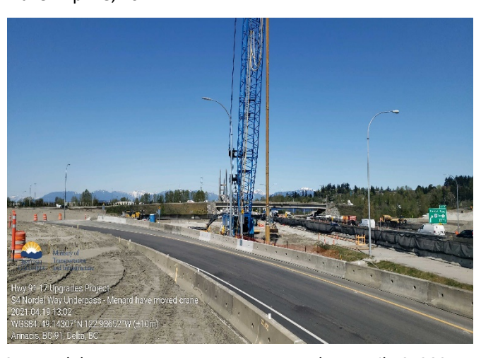
S4: Nordel Way structure crane move. Taken April 19, 2021