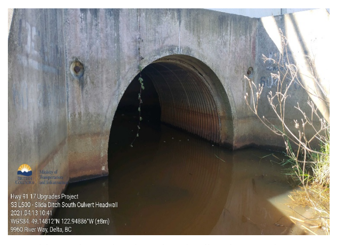
S3: Silda Ditch south culvert headwall. Taken April 13, 2021