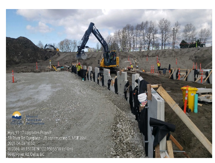
S1: River Road structure - S. MSE wall construction. Taken April 8, 2021