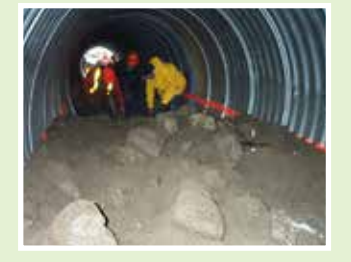
A conveyor system provides a means for infill material to be delivered into the culvert.

A powered self-dumping wheelbarrow is commonly used for infilling a culvert. With any delivery equipment, adequate space is required to be able to deliver and manipulate the imported material. Wheelbarrows require adequate clearance to dump without contacting the culvert, as well as to safely maneuver.