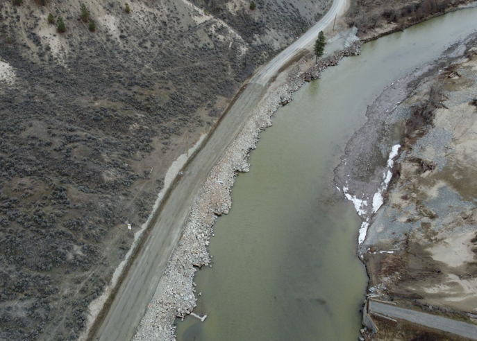
Clusters of rocks (groynes) are placed at Site 4 to deflect the continuous river flow, supporting movement of sediment which creates complexity in the river bed and fish habitat (March 2022)