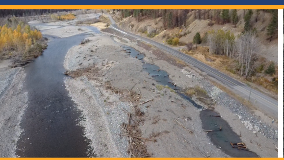
Side channel, including woody debris and roots, at Site 3 (October 2022)