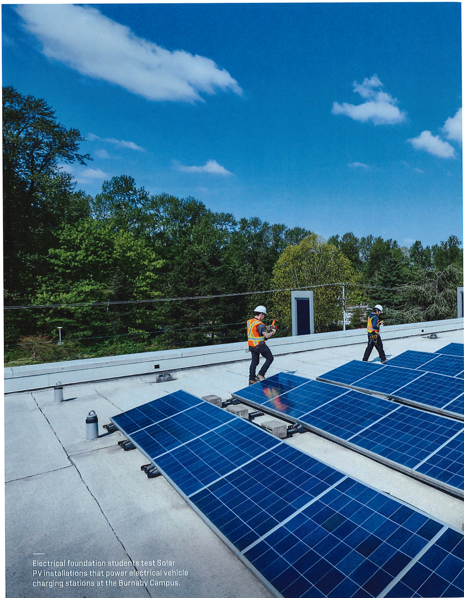
Electrical foundation students test Solar PV installations that power electrical vehicle charging stations at the Burnaby Campus.