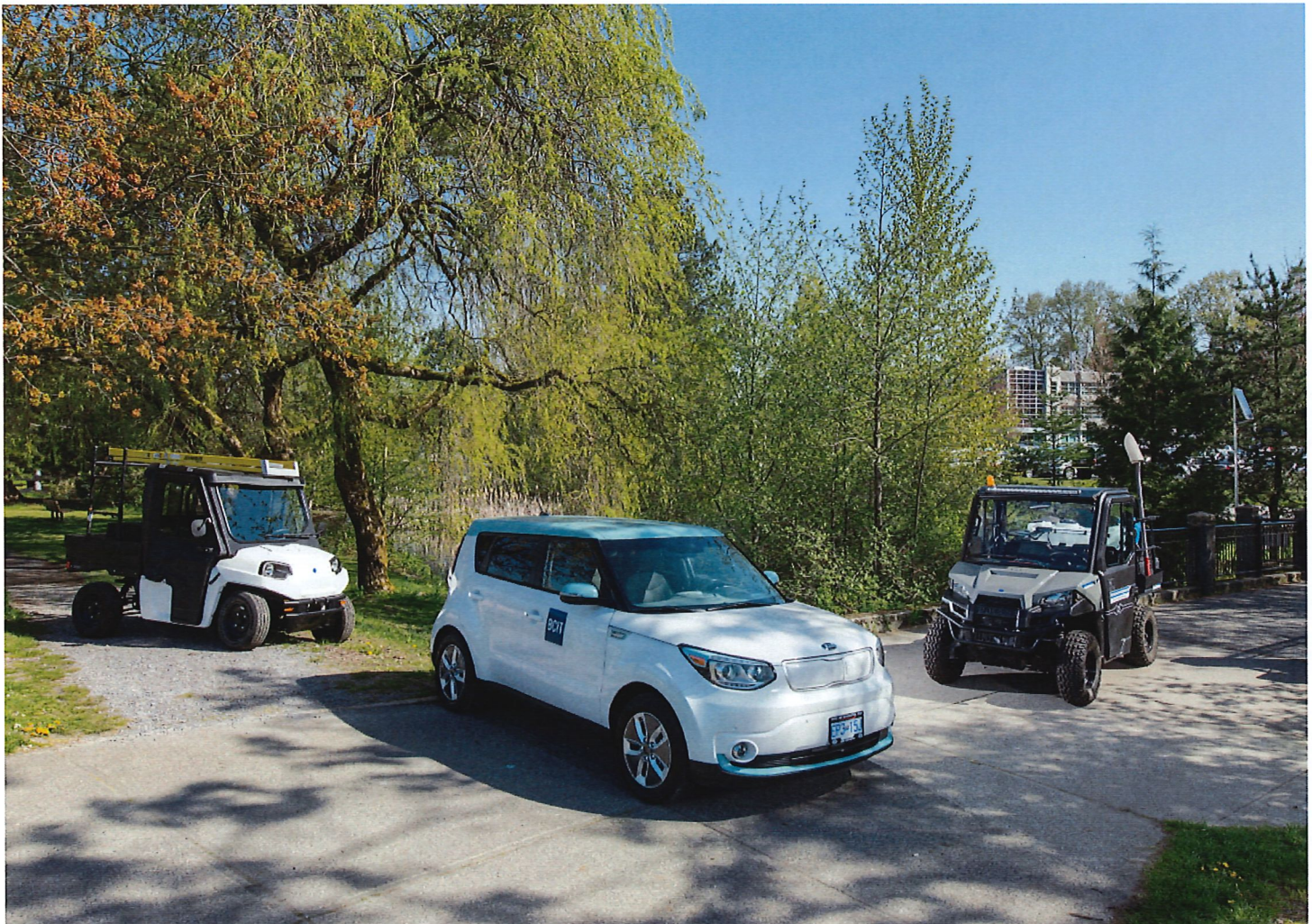
Examples of electric vehicles in the Burnaby Campus Facilities Services fleet.