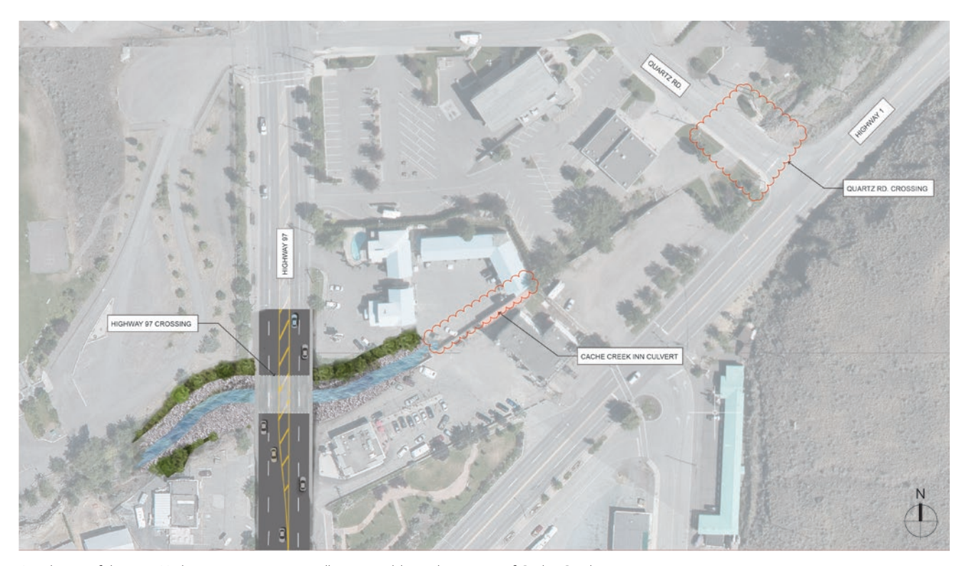
Aerial view of the new Highway 97 crossing as well as two additional crossings of Cache Creek.

Consultation with local First Nations is ongoing. Bonaparte First Nation is working closely with the project team.