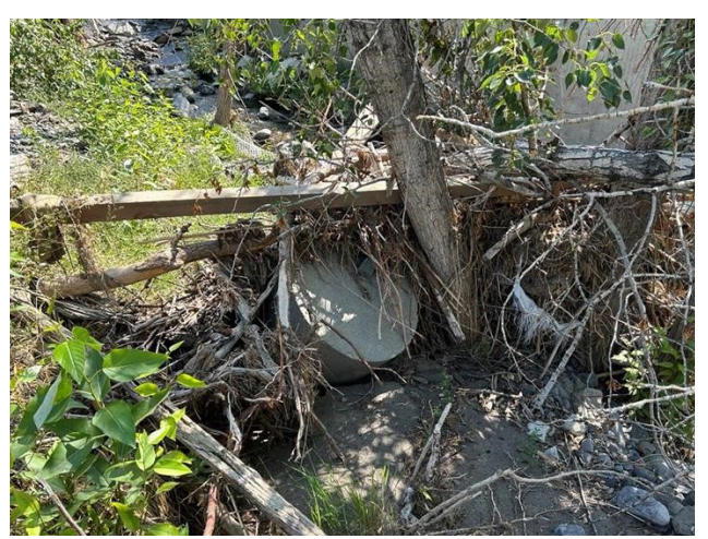
Enhancements to Cache Creek will include the addition of plants and trees to the riparian area and clean up of debris in the creek.