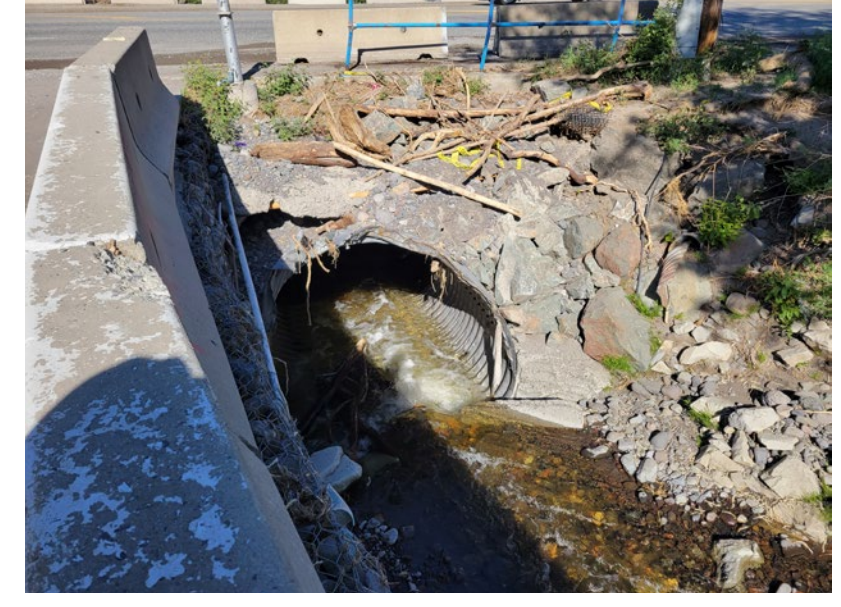
The culvert that runs under Highway 97. Photo taken in June 2023.