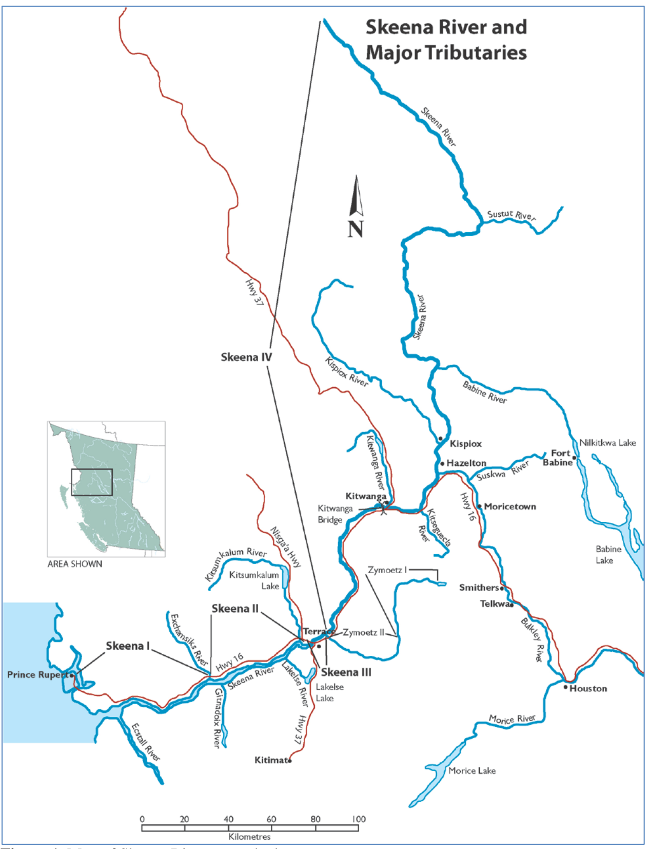
Figure 1. Map of Skeena River watershed.