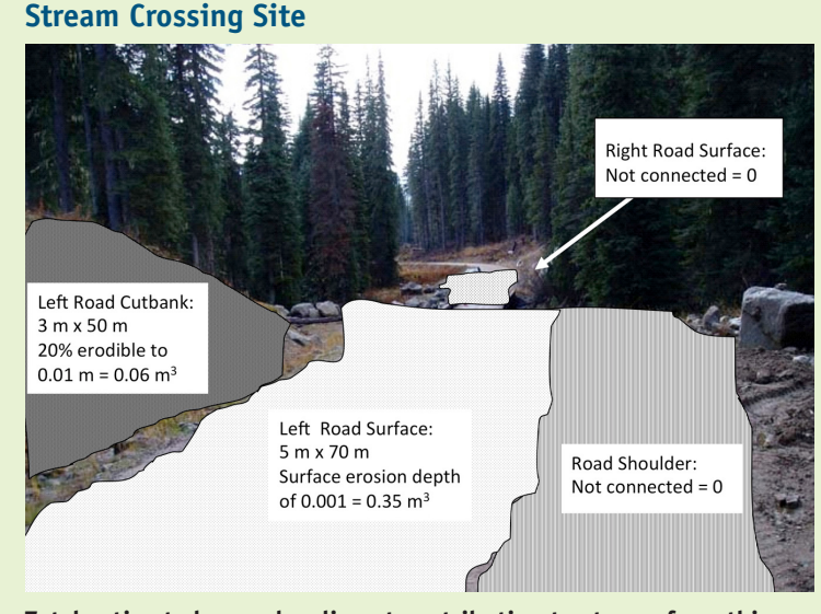
Total estimated annual sediment contribution to stream from this site = 0.41 m<sup>3</sup> per year

Sites where fine sediment generation exceeds a certain threshold are further assessed to consider management actions or prescriptions to reduce impacts to water quality.