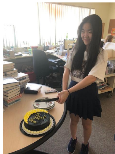
STEAM Programs Facilitator