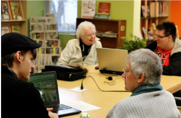
User Friendly drop-in tech help.

We will continue to utilize our new resources in the upcoming year by offering opportunities, along with community partners, for our patrons to learn new and essential digital skills.