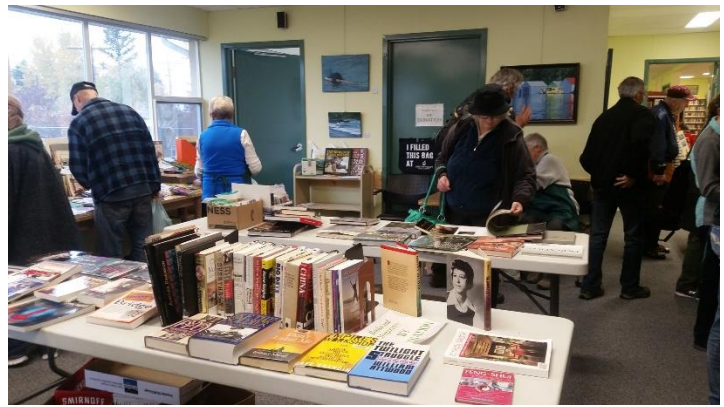
Friends of the Library bi-annual book sale