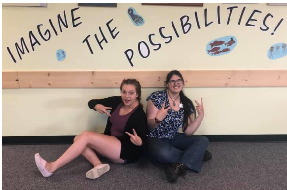
Summer Reading Club Coordinator & Assistant