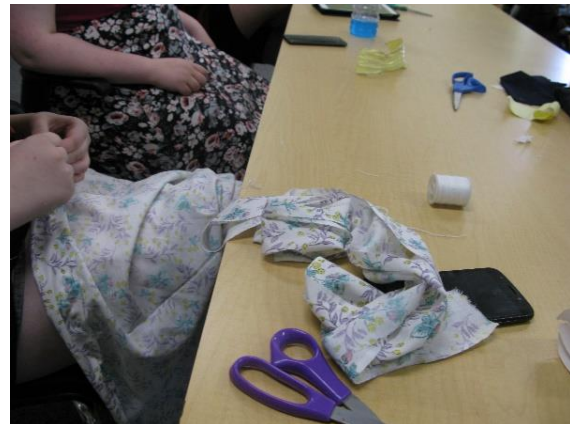
Teen Cosplay Club