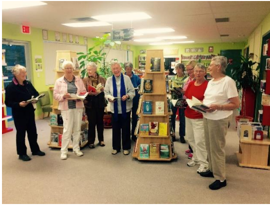
The Friends of Creston Library