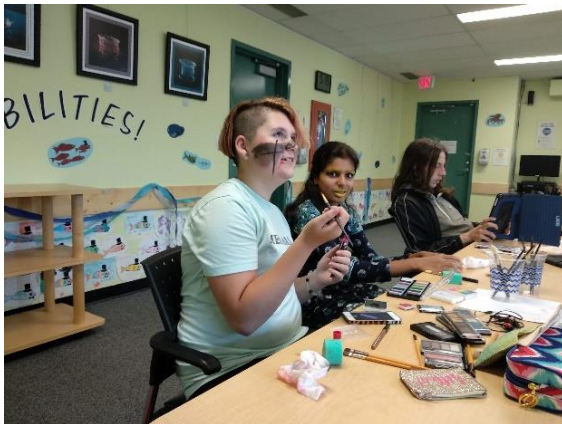
Teen Cosplay Club

In 2020 we have continued the Teen Cosplay Club, STEAM programming for kids, and have embarked on a “Living the Change” speaker and workshop series for patrons concerned about the effects of Climate Change.