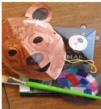
Art class at the Bear Arts Festival. Community Outreach in the Summer of 2019 which had 32 children attend.