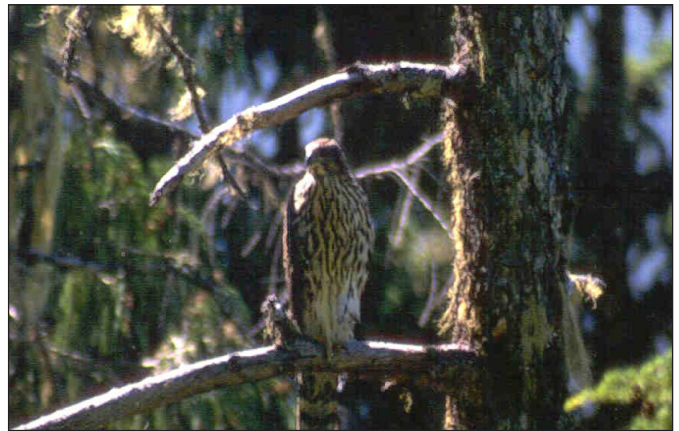
Fledgling Northern Goshawk

The next step in developing an effectiveness evaluation for Goshawk WHAs is development and testing of data collection protocols for the recommended indicators. Some indicators, especially the validation indicators, require refinement, and a process must be developed for assessing effectiveness in terms of combined results from all indicators. A statistical analysis framework will be established for the pilot study to address statistical design, sampling regimes, indicator sensitivity and sample size requirements. We will prioritize WHAs to evaluate and the framework will be refined for implementation of the final effectiveness protocol. Results from the pilot and long-term monitoring will be provided to wildlife and forest managers responsible for conservation of Goshawks and their habitat in B.C.