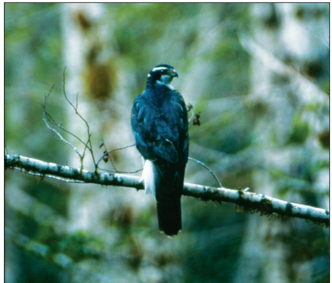
Adult Northern Goshawk

designation of WHAs and associated management practices (General Wildlife Measures - GWMs) to protect important Goshawk habitats as specified in the Accounts and Measures for Managing Identified Wildlife (2004) 4 . Loss and fragmentation of mature and old-growth coniferous forest to forest harvesting, and the resulting reduced availability and condition of Goshawk nesting and foraging habitats, is probably the most significant factor threatening Goshawks in coastal British Columbia.