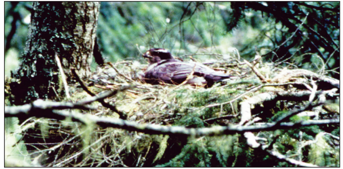
Northern Goshawk on nest