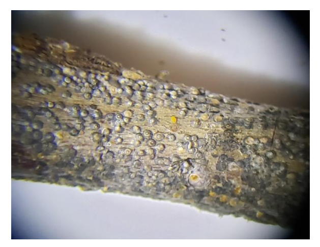
San Jose scale on a cherry twig

San Jose scale overwinters in the immature blackcap stage on bark in tops of trees. Adults mature in spring and winged males emerge at full bloom to petal-fall of apples. Males fly or walk to reach pheromone-emitting females. The immobile females produce living young called crawlers. Crawlers move to new feeding sites on fruit or bark, insert their sucking mouthparts to feed, secrete wax to form a shell and then lose their eyes, legs and antennae. There are two to three generations per year.