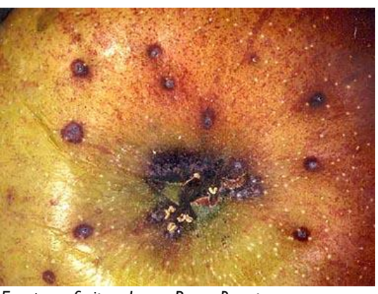
European fruit scales on Rome Beauty

European fruit scale overwinters in the immature blackcap stage on or under rough bark of scaffold limbs. Adults mature in spring, and winged males emerge near the pink stage of apples. Males fly or walk to reach pheromone-emitting females. The sedentary, shelled females produce living young called crawlers. Crawlers move to new feeding sites on fruit or bark,