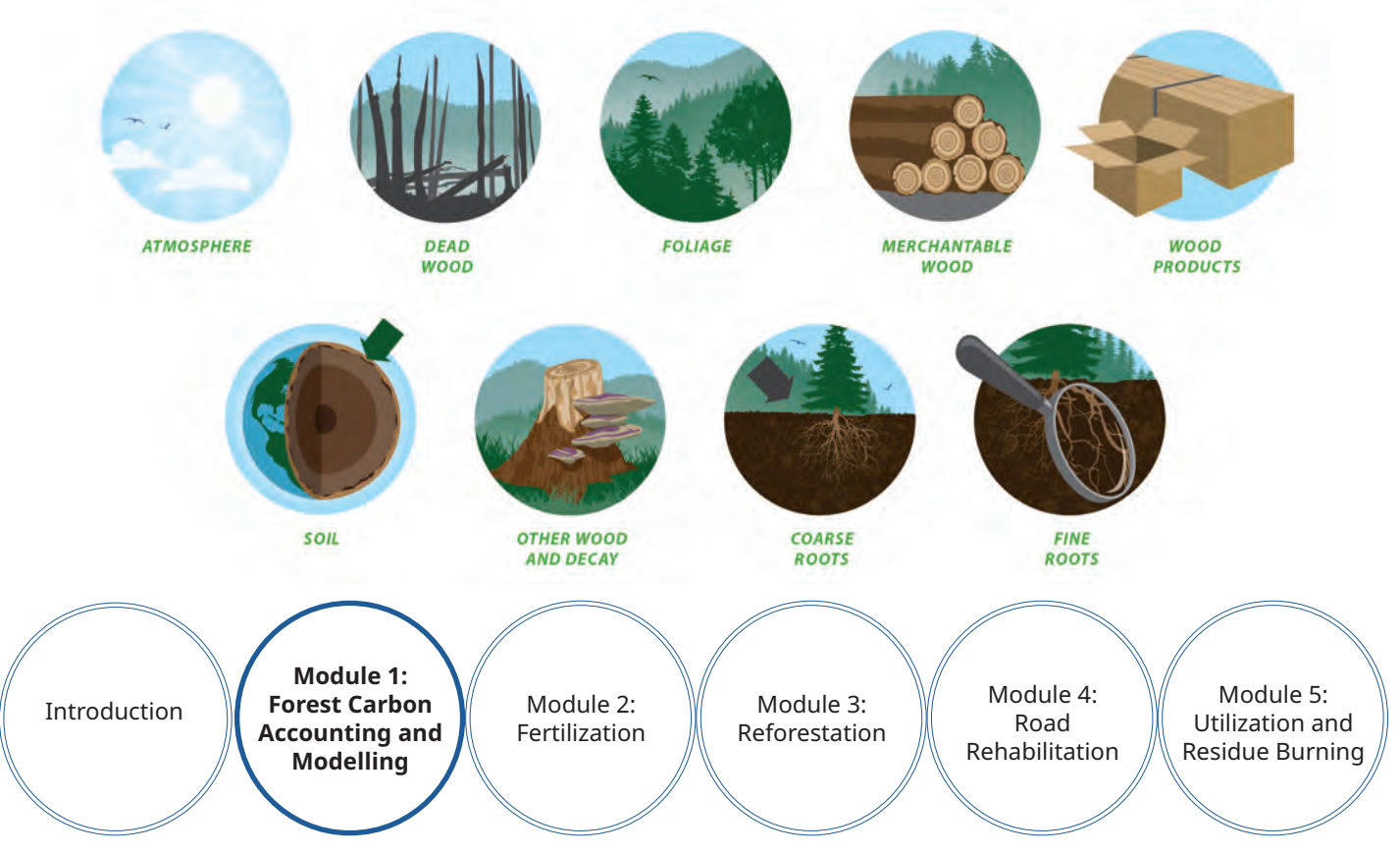
Figure 1: Carbon Stocks

The carbon balance of a forest ecosystem can be thought about in terms of two different concepts: carbon stocks and carbon fluxes. Carbon stocks represent the absolute quantity of carbon held within an ecosystem at a specified time. These stocks consist of different carbon pools both within the forest ecosystem, such as live biomass, soil and deadwood biomass, as well pools external to the system, such as wood products (see Figure 1).