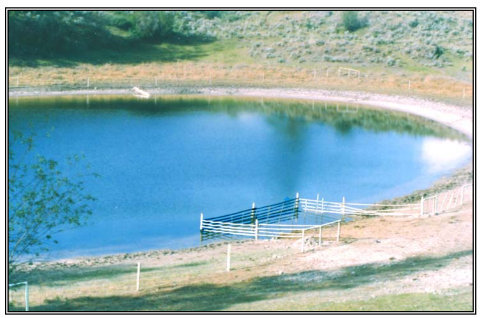
Restricted Livestock Access To A Pond The fence denies livestock access to the pond except at the chosen watering point.

Unrestricted Access. This option may have the greatest risk of pollution unless carefully matched to the livestock use. Evaluate such access with the characteristics of the site and degree of expected livestock activity in mind. This type of access is commonly used on sites of low density grazing, such as on dryland pastures. It may not be appropriate for high-use sites, such as summerlong grazing on irrigated pastures.