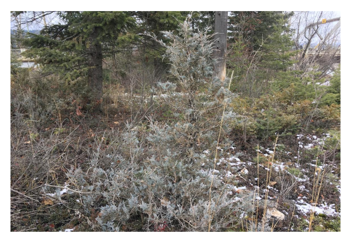
Photograph 17: Section 7 – Looking west, Vegetation of median.