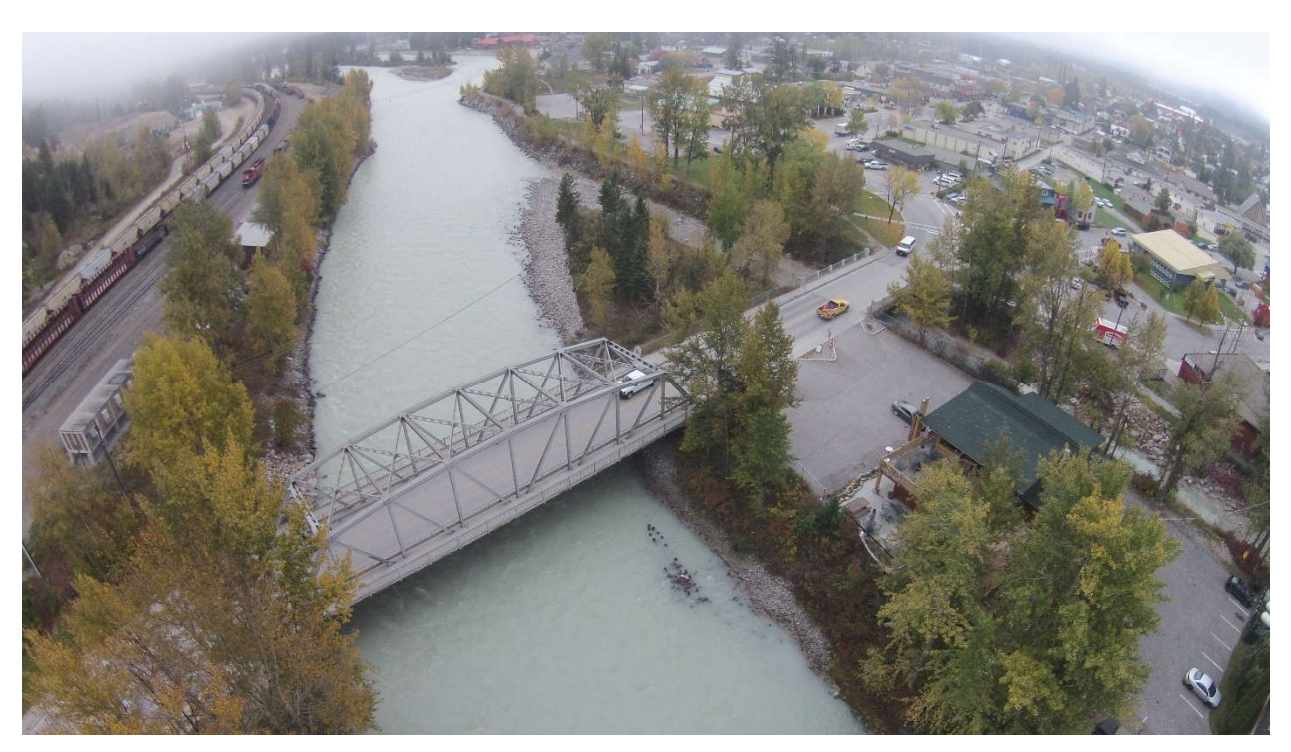
Figure 2. Aerial view of existing Kicking Horse River Bridges 1 and 2

flower (Linnaea borealis), and clasping-leafed twisted stalk (Streptopus amplexifolius) (Meidinger, D. and Pojar, J., 1991).