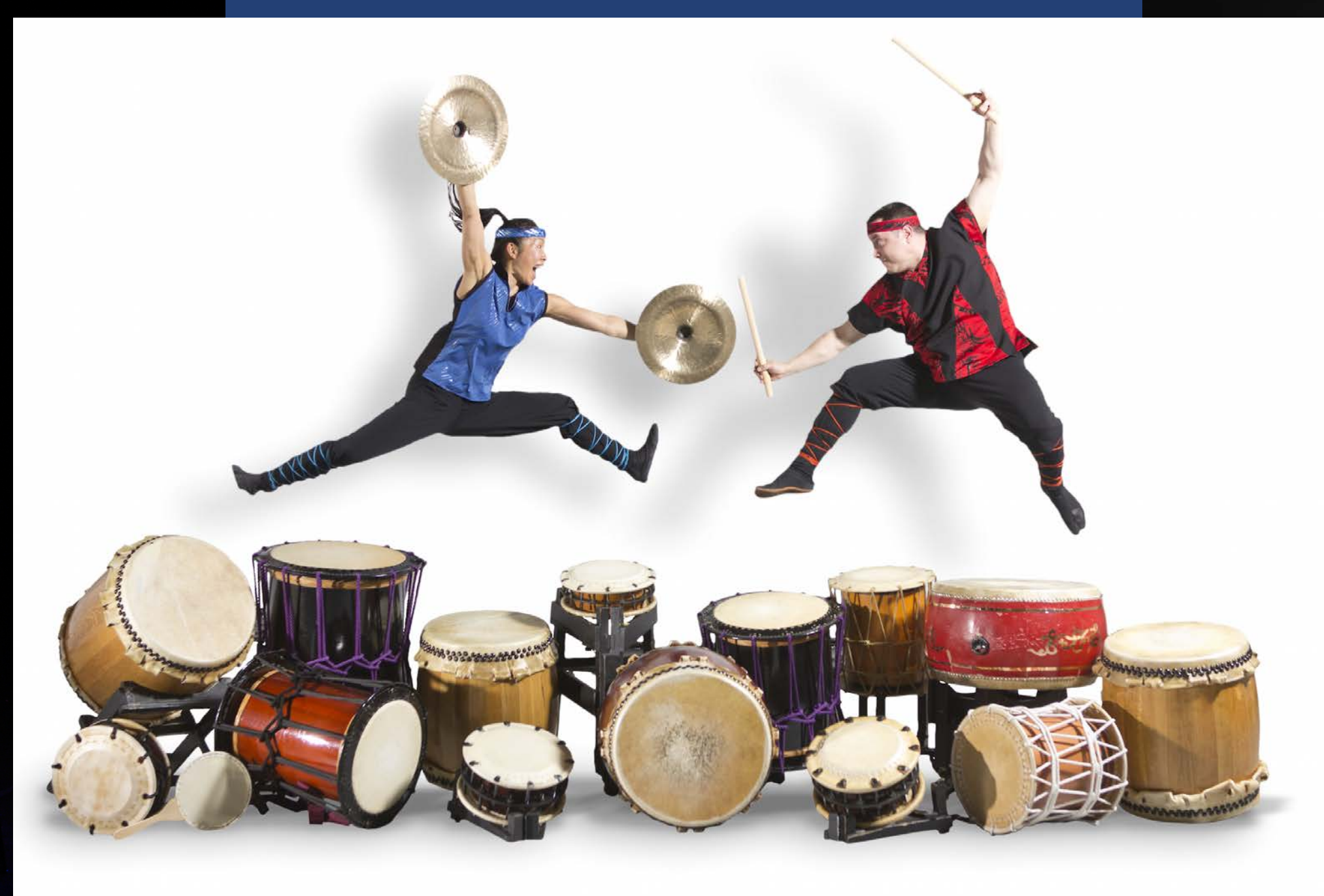
Uzume Taiko Drum Group Society, based in Richmond, received $12,000 in 2020/21 to assist with their outreach, school and public performance programs.