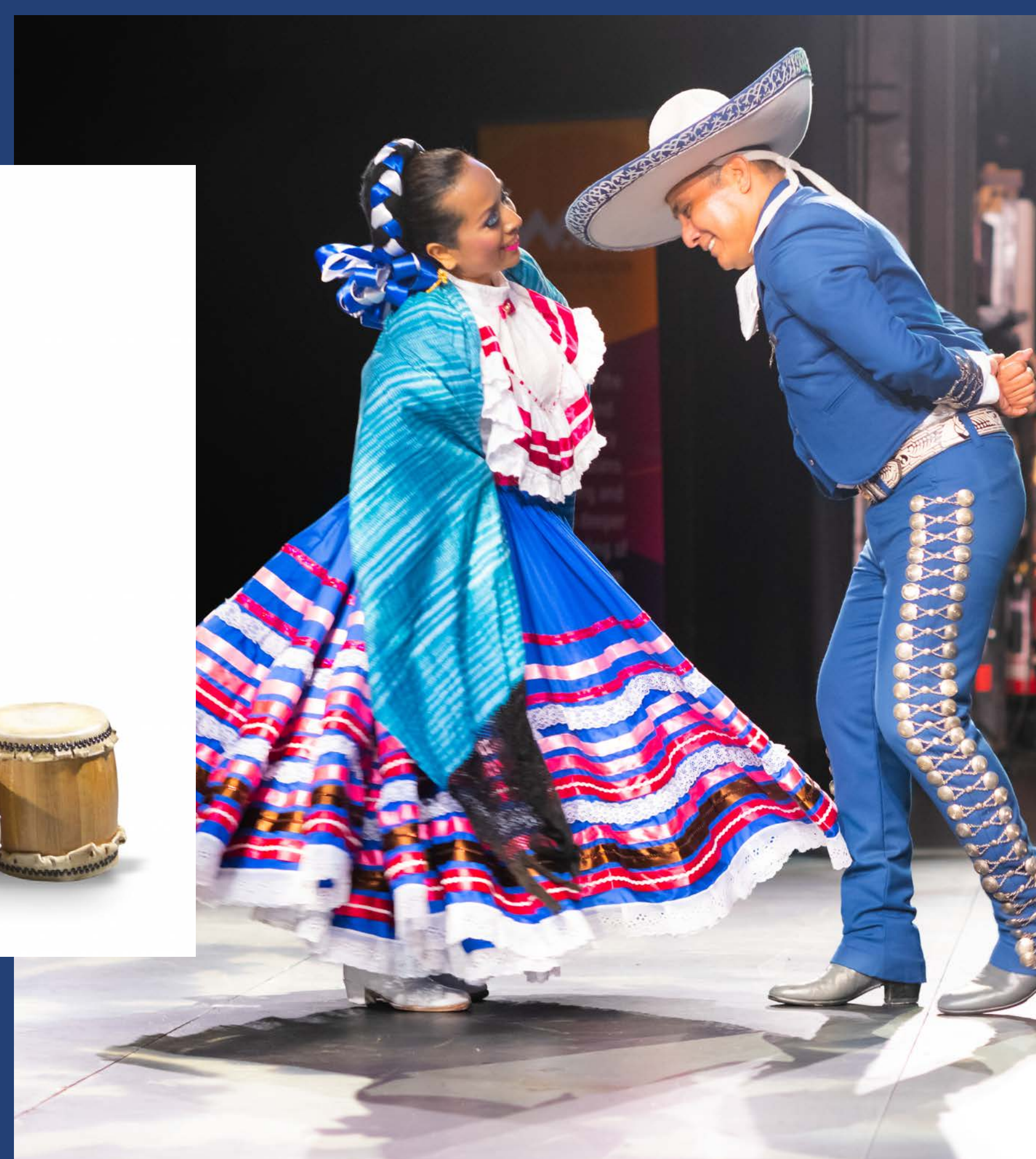
The Vancouver Latin American Cultural Centre received $12,500 in 2020/21 to support their Latin American community presentation and education program.