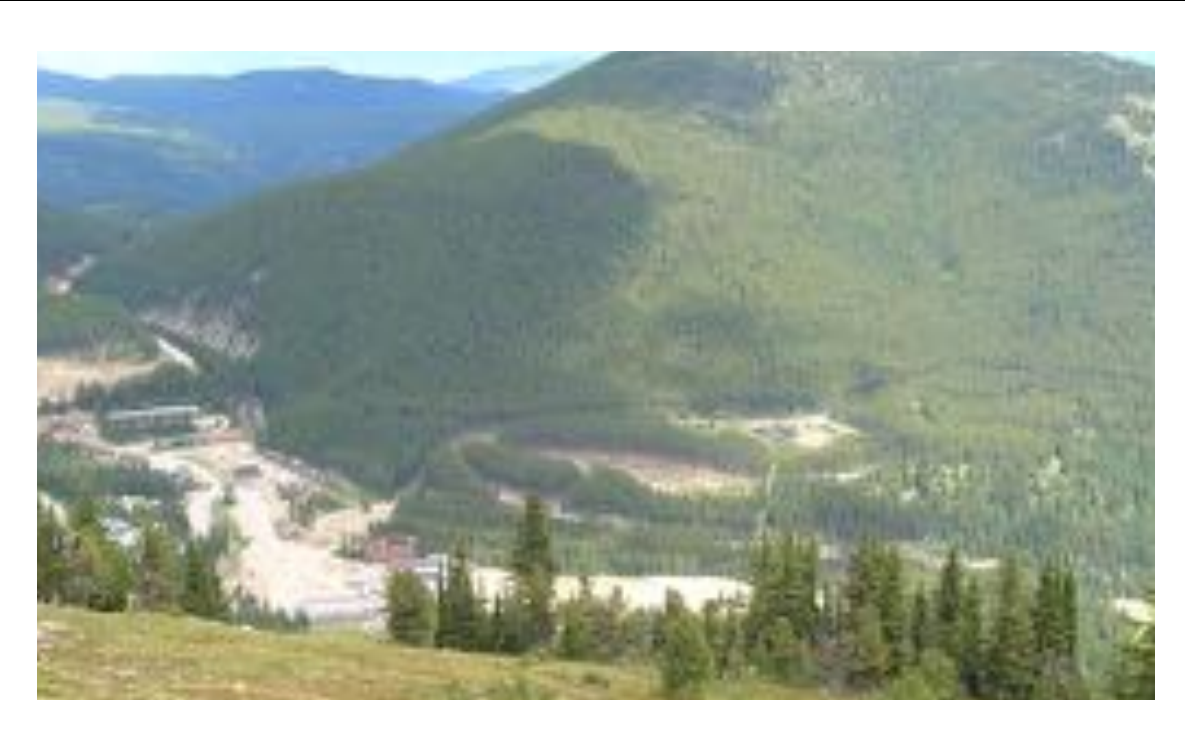
View of Apex Village and Green Mountain, taken from Apex ski run in 2010