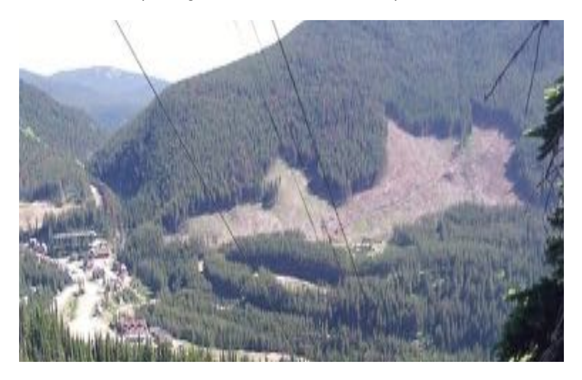
View of Apex Village and Green Mountain, taken from Apex ski run in 2012