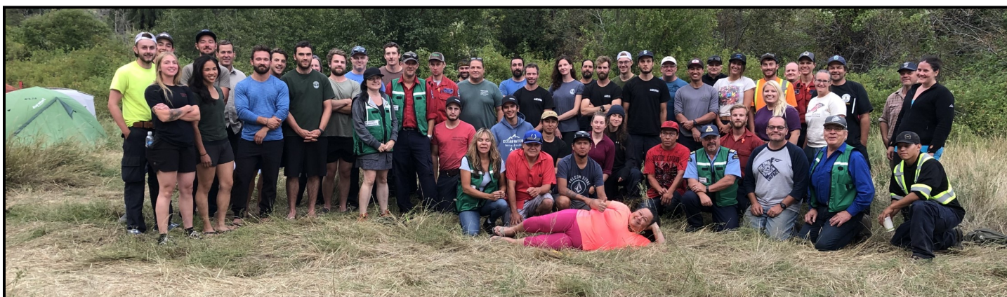
Big Bar Landslide field camp near the site of the incident.