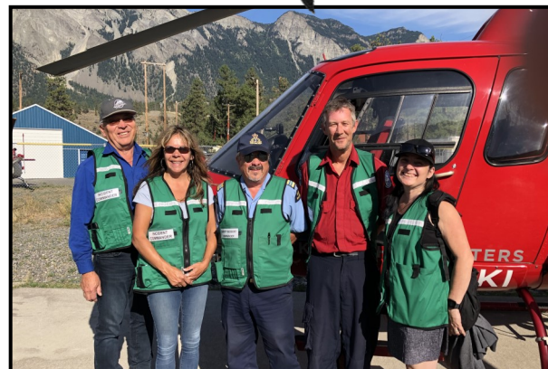
Unified Incident Commanders.