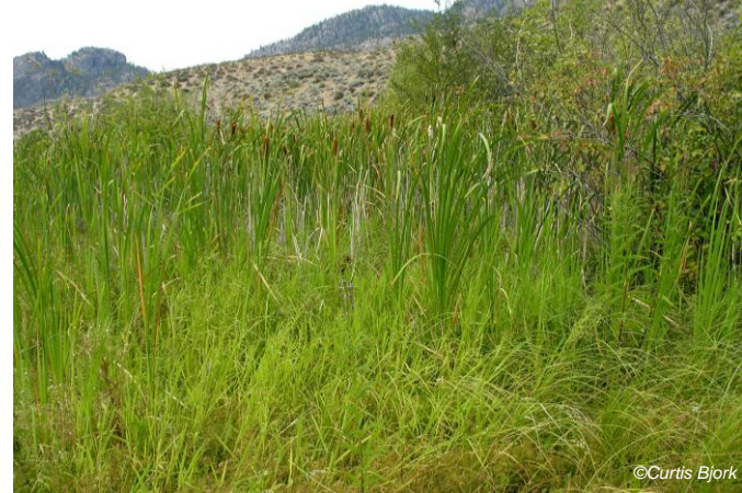
Figure 3 Cattail marsh habitat near Osoyoos, B.C. (with blue-listed Berula erecta )