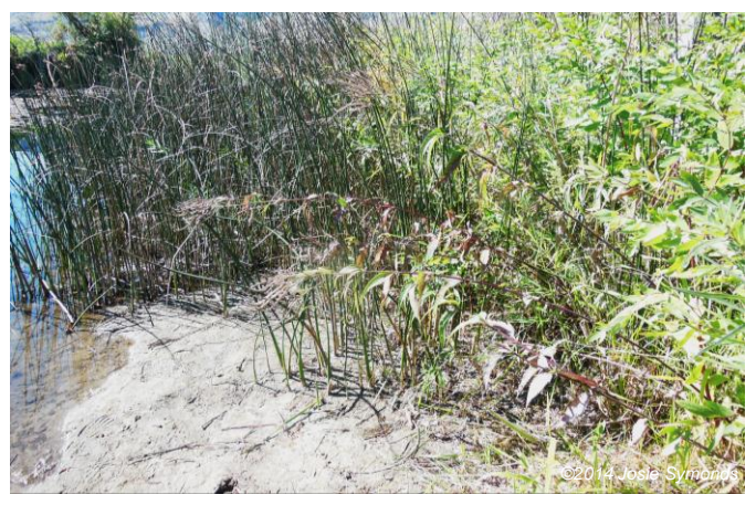
Figure 2 Marsh habitat along an Okanagan River oxbow, B.C.