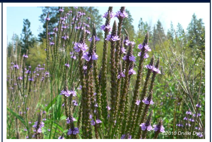
Figure 6 Close up showing dense violet flower spikes