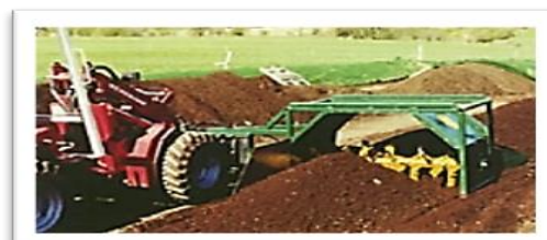
Figure 2. Windrow composting and windrow turner.

★ In general, the more passive the composting process, the longer it takes to complete the active composting period. If odour control is required, it is easier to facilitate in closed systems.