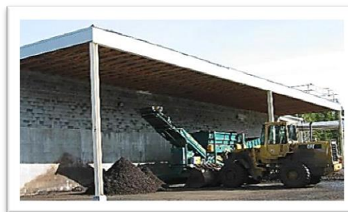
Figure 5. Screening finished compost under cover on a paved road.

A retail grade product should have less than 1% by weight foreign matter. Consequently, screening is done to remove oversized materials such as bulking agents, stones, metals, etc.