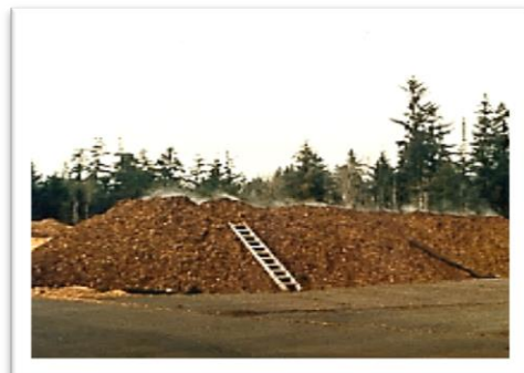
Figure 3. Aerated static pile.

Aeration allows for proper airflow and makes oxygen available to the microorganisms. This helps maintain appropriate levels of moisture and temperature. Aeration depends on the size and shape of the particles in the compost mix; larger particles and loosely packaged materials make the compost more porous, increasing airflow and reducing moisture accumulation; small particles will be more compacted, making air flow more difficult. To avoid odour problems and complaints, try to mix, turn and move the compost during conditions or a period of time that is least bothersome to neighbours such as windy conditions and early mornings.