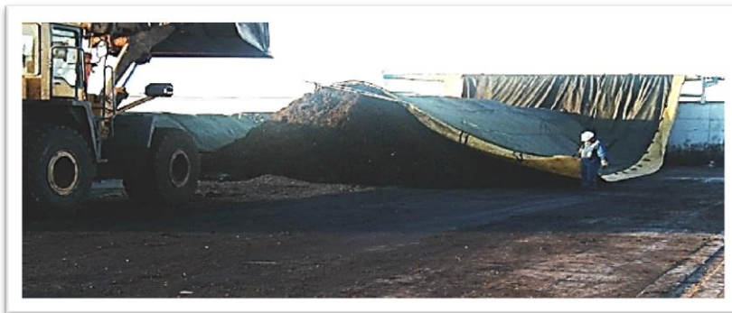
Figure 1. An aerated static pile system with a fabric cover for moisture and odour control.