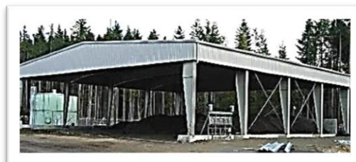
Figure 4. An aerated curing system under cover on a paved road.

The curing process takes place when the organic matter that has undergone the rapid initial stage of composting is further matured into a humus-like material. A well-stabilized material may only need time to cure. Material that is not fully stable may require aeration, turning and temperature monitoring.