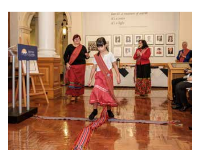
Louis Riel Day 2019, Métis and provincial government representatives gathered in the Hall of Honour of the B.C. Parliament Buildings to proclaim Louis Riel Day and celebrate the contributions of the Métis people to British Columbia.