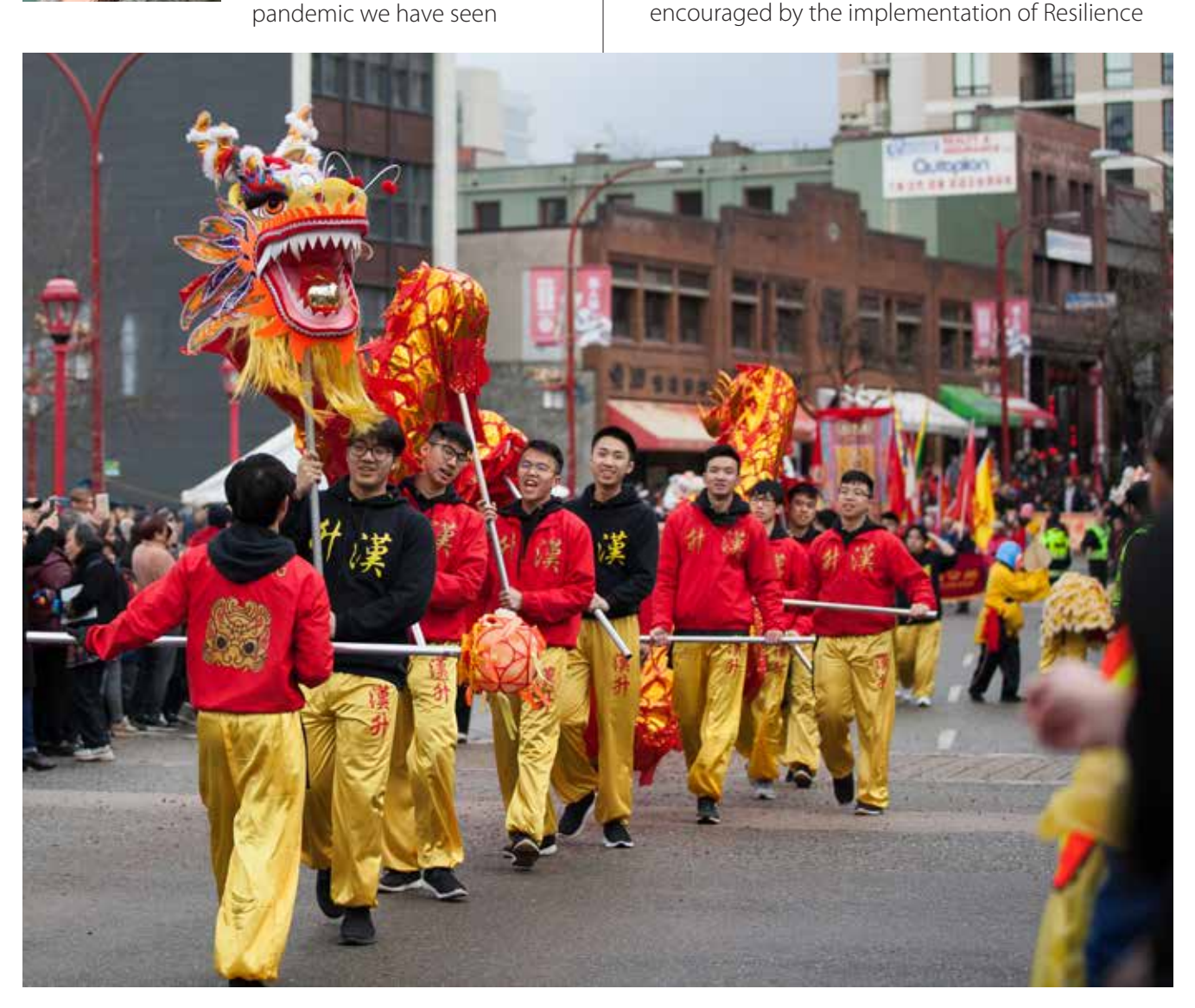
Lunar New Year celebrations in Vancouver's historic Chinatown.

We are encouraged to see public dialogue shifting to look at how we can work across government ministries and other public institutions to address broad issues of racism at the individual, societal and institutional level. We feel fortunate to have strong leadership in B.C., with a government that has already taken some critical steps by reintroducing the BC Office of the Human Rights Commissioner and passing the Declaration of the Rights of Indigenous Peoples Act in 2019. We are also encouraged by the implementation of Resilience