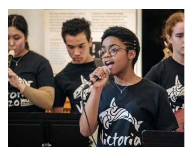
2020 Journée de la francophonie in BC. The 18th annual BC Francophonie Day was celebrated in the Hall of Honour at the B.C. Legislature, highlighting francophone youth and their excellence in sports, leadership and the arts.

population <sup>4</sup>. Another one of British Columbia's fastest growing languages is Philippine-based Tagalog with more than 67,000 people in Metro Vancouver speaking Tagalog as their mother tongue in 2016, up from almost 48,000 people five years earlier.<sup>5</sup>. This corresponds directly to immigration patterns – one of the top sources of permanent residents in Metro