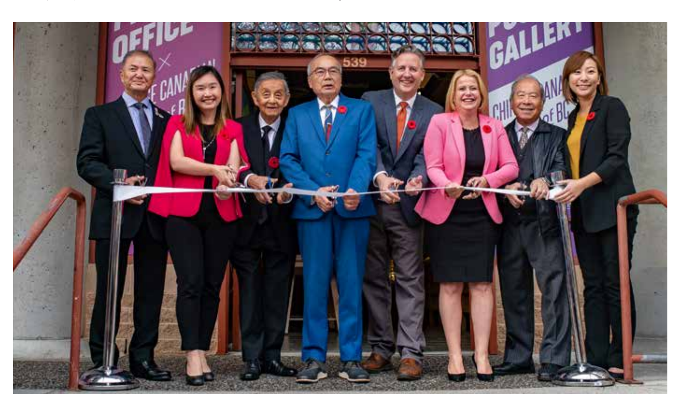
Preserving and celebrating Chinese Canadian heritage, culture in B.C. People soon will be able to learn about, and celebrate, the history of Chinese Canadians in British Columbia as the Province takes another step toward establishing a Chinese Canadian museum, 2019.

Establishing a Chinese Canadian museum is part of the government's partnership with the City of Vancouver to work together to pursue a United Nations Education, Scientific and Cultural Organization (UNESCO) World Heritage site designation for Vancouver Chinatown.