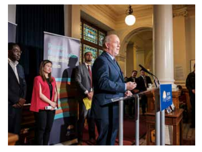
Anti-racism network launches to build safer communities for people, November 2019