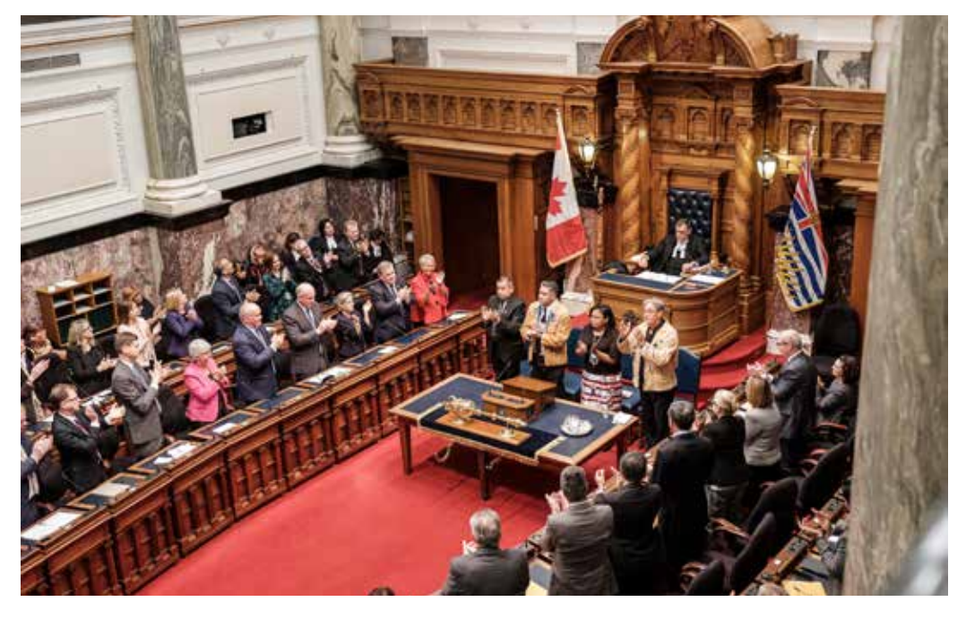
Recognizing and protecting the rights of Indigenous peoples. On October 24, 2019, British Columbia became the first province in Canada to put the UN Declaration on the Rights of Indigenous peoples into law.

The provincial government holds itself accountable for its actions and offers mechanisms for British Columbians to seek recourse in instances where their rights are not respected, such as the BC Human Rights Tribunal and BC Human Rights Clinic. The newly reinstated Office of the Human Rights Commissioner addresses the root causes