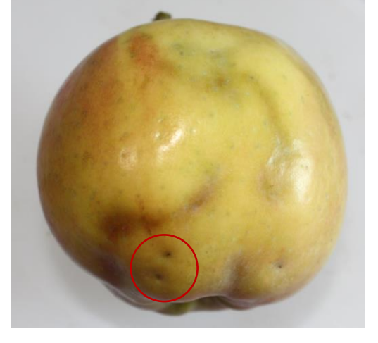
Internal feeding damage by apple maggot. Larvae can be seen in the circle.