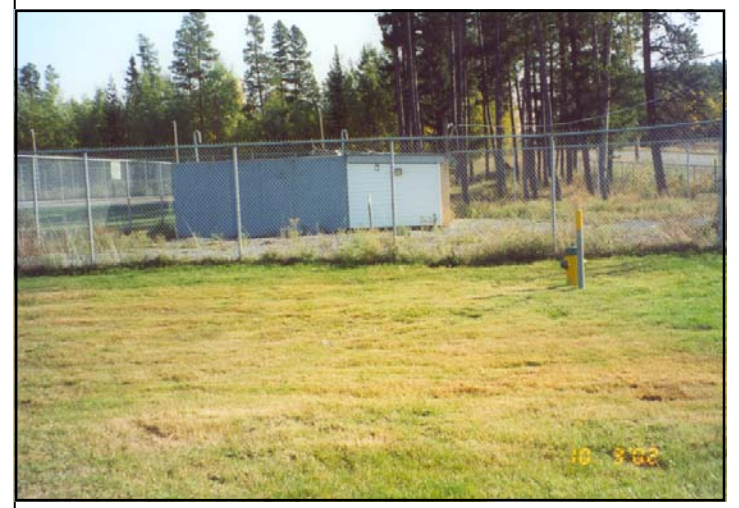
Plate 1. A view of the Buckhorn pump house where the raw water samples were collected.

The province's Drinking Water Protection Act, enacted in October, 2002, places the responsibility for drinking water quality protection with the B.C. Ministry of Health and local water purveyors. However, through the B.C. Environmental Management Act, the British Columbia Ministry of Environment (MOE) is responsible for managing and regulating activities in watersheds that have a potential to affect water quality. Accordingly, the Ministry