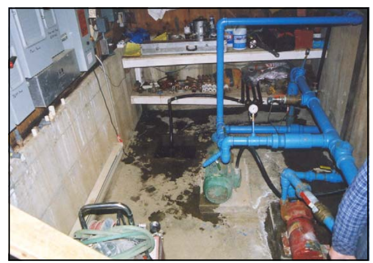
Plate 2. A picture of the raw water tap inside the Buckhorn pump house.

contamination by system piping. Water samples were shipped by overnight courier in coolers with ice packs to CanTest Ltd. (from September 2002-March 2003) and JR Laboratories Inc. (April 2003 to September 2003) for bacteria and PSC Environmental Services Ltd. for chemistry. Bacterial samples were analysed using membrane filtration. Metals analysis made use of ICPMS technology.