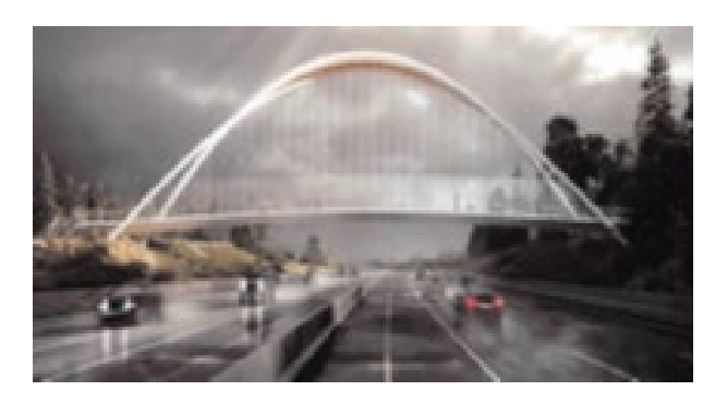
Lake Burnaby Ped. & Bike. OH – Hwy 1, Burnaby – Fall 2023 construction –