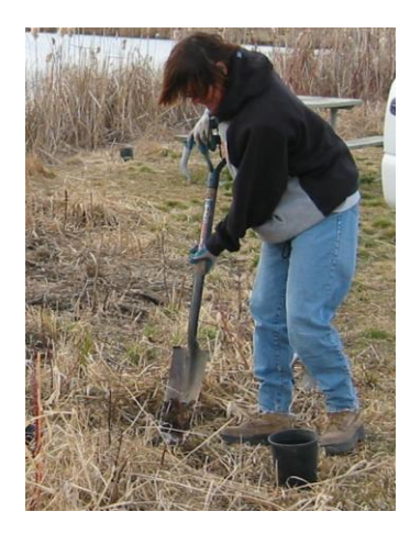
Choose native plants suited to the site conditions (i.e. suited to the biogeoclimatic sub zone and site series). Adjacent undisturbed riparian areas can be used as reference areas for suitable species.