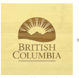
Wood Engraved Painted Light