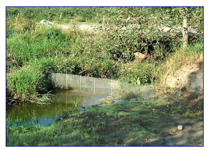
Figure 1 Sediment Trap with Temporary Silt Fence During Cleaning

Sediment traps may be installed where accumulations of sediment consistently occur, such as the point where two constructed ditches meet or at a significant break in slope where water velocity slows and sediment drops out of the water column and accumulates.