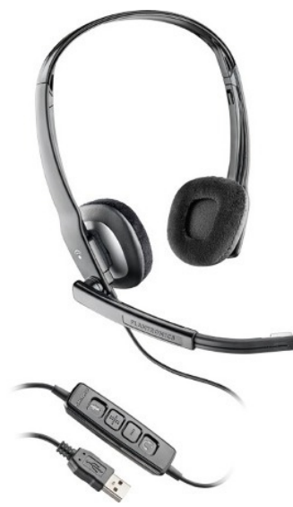
Binaural Blackwire C210M