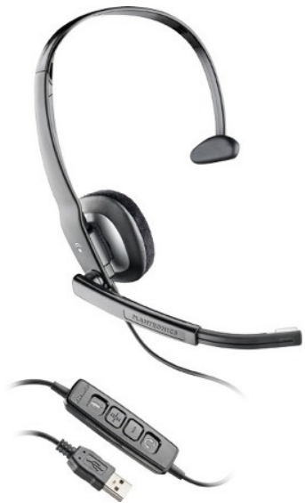
Monaural Blackwire C210M

We have two compatible convenient hands-free headsets.