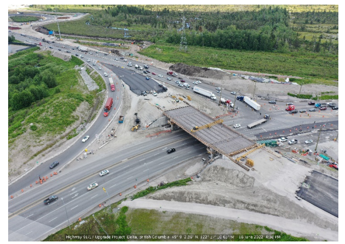
Hwy 17/Hwy 91C paving of east and west approaches; preparations for the deck concrete pour. Taken June 16, 2022