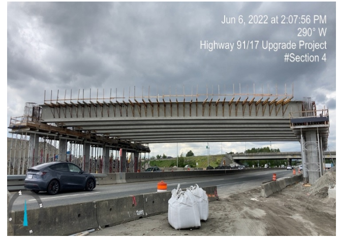
Hwy 91 and Nordel Interchange installation of girders for bridge structure. Taken June 6, 2022