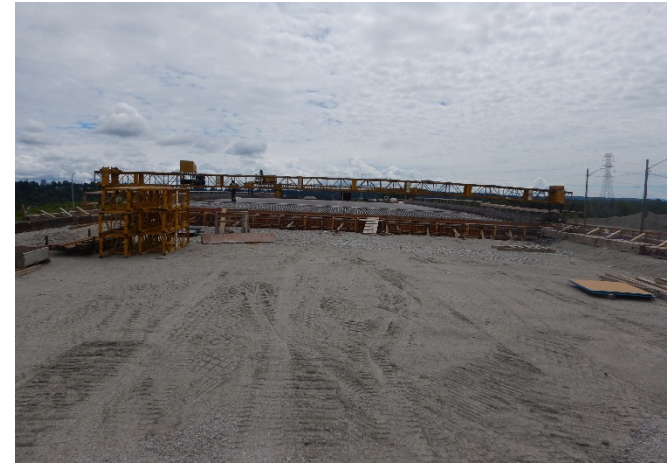
Hwy 17 overpass work. Taken June 11, 2022