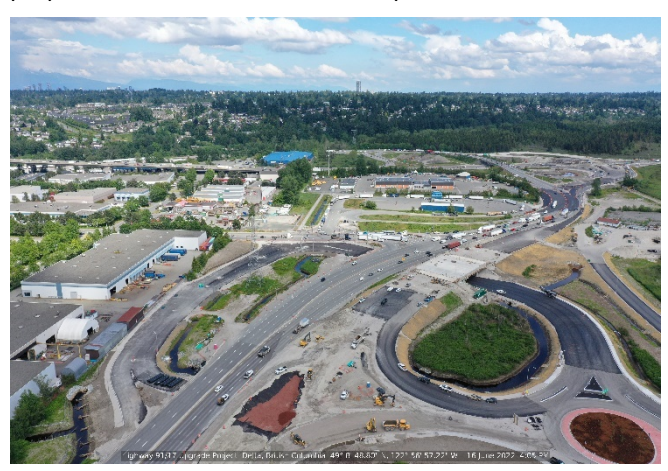
Hwy 91C/Nordel Way deck pour and paving of ramps. Taken June 16, 2022

River Road/Hwy 17 final completion works. Taken June 16, 2022