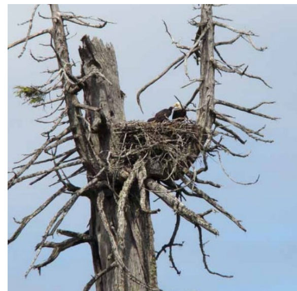
Bald Eagle Nest ( Wildlife Act ) Golden Eagle tree nests look similar, or nests can be constructed on cliff ledges