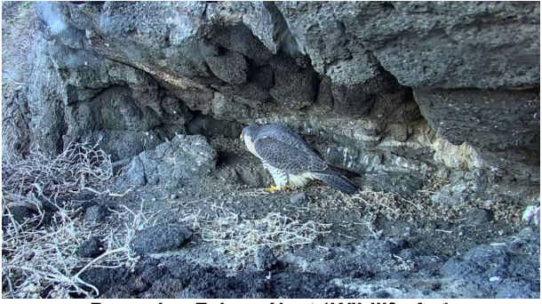
Peregrine Falcon Nest (Wildlife Act)