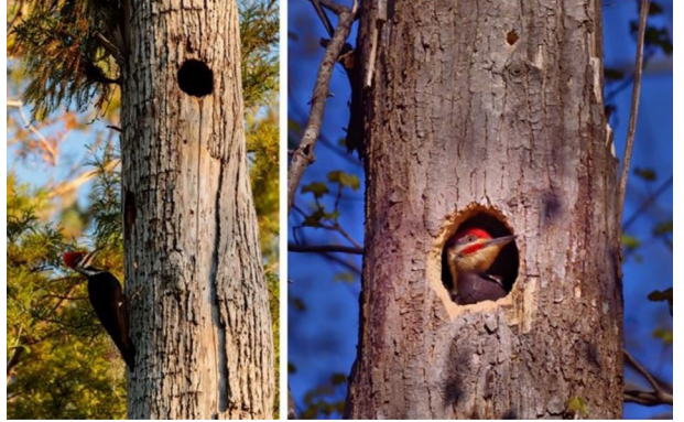
Pileated Woodpecker Cavities (Schedule 1 MBR)

The inactive nests of these species have regulatory protection.