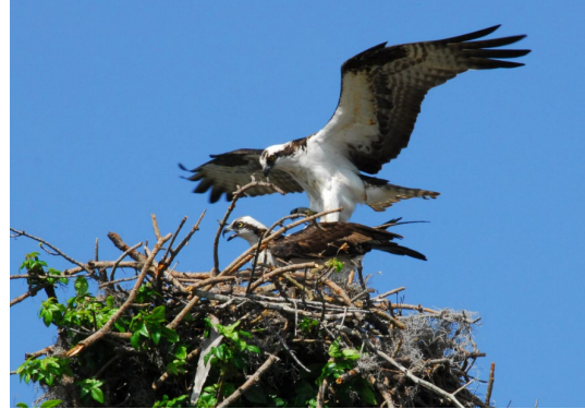
Osprey Nest (Wildlife Act)