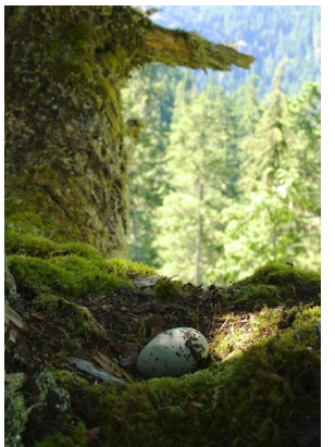
Marbled Murrelet Nest (SARA)