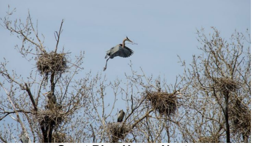
Great Blue Heron Nests (Wildlife Act, Schedule 1 MBR)