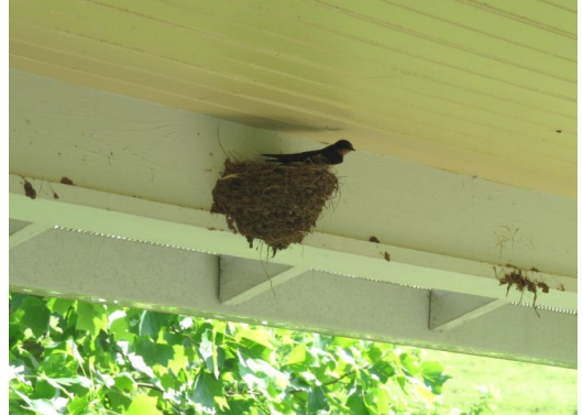
Barn Swallow Nest (SARA)