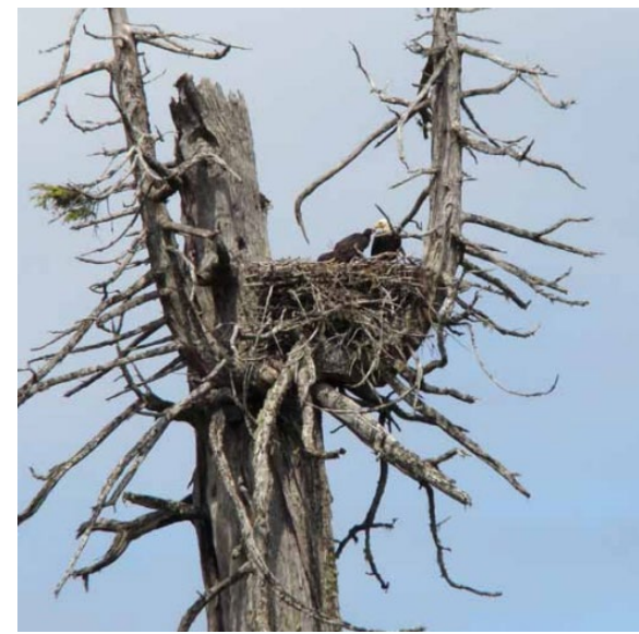
Bald Eagle Nest ( Wildlife Act ) Golden Eagle tree nests look similar, or nests can be constructed on cliff ledges