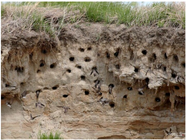
Bank Swallow Nesting Cavities (SARA)