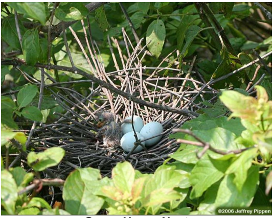
Green Heron Nest (Wildlife Act, Schedule 1 MBR)