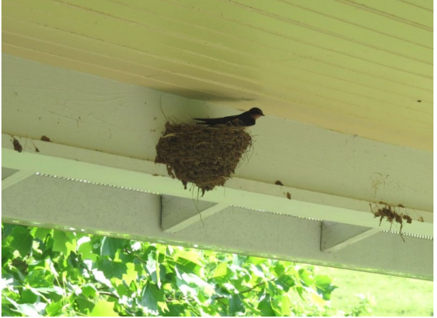
Barn Swallow Nest (SARA)