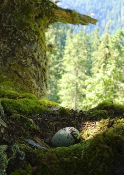
Marbled Murrelet Nest (SARA)