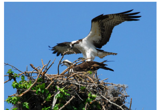
Osprey Nest (Wildlife Act)