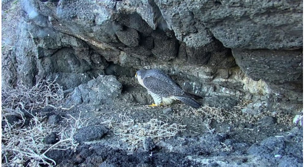
Peregrine Falcon Nest (Wildlife Act)