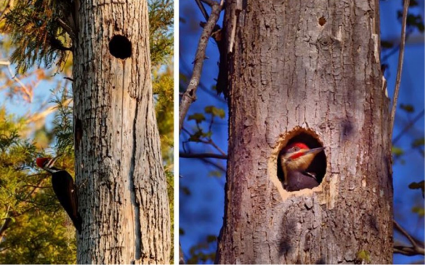
Pileated Woodpecker Cavities (Schedule 1 MBR)

The active and inactive nests of these species are protected. The species on this page nest in all regions of BC.