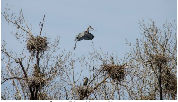
Great Blue Heron Nests (Wildlife Act, Schedule 1 MBR)