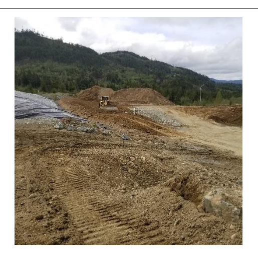
Stockpile Location - Looking West