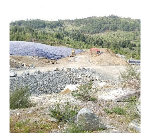
Site – Looking Southwest

No: 67 CONSTRUCTION: Landfill Closure WEATHER: Sun 13°C PAGE: 3 of 4