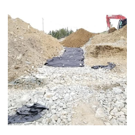
Soak Away Trench