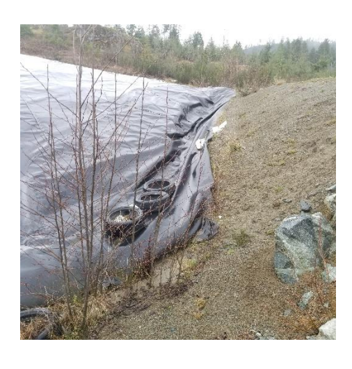
PEA – NW Corner