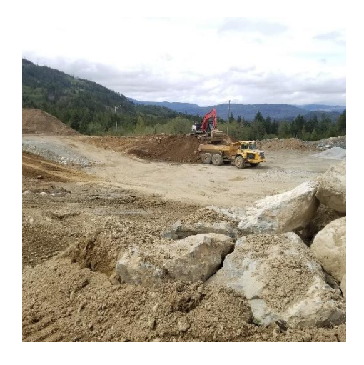
Stockpile Location – Looking Northwest