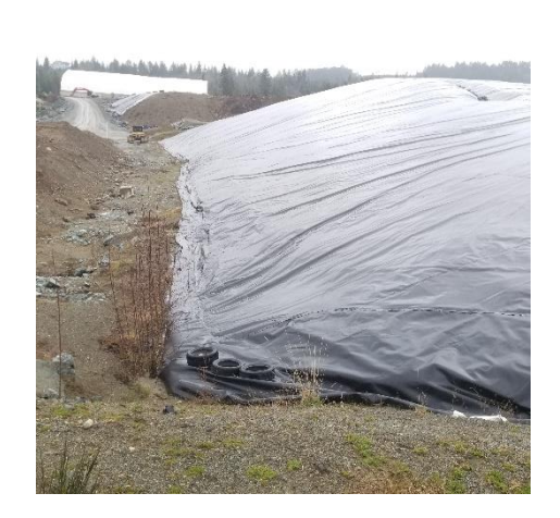
PEA – North Face