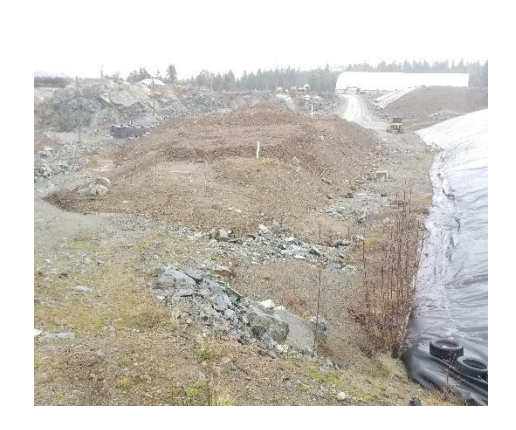
Site – Looking East