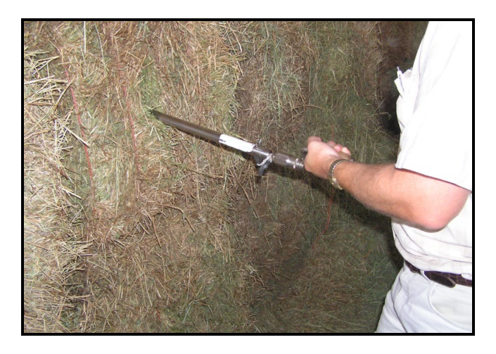
Figure 2. Collecting a core from a square bale