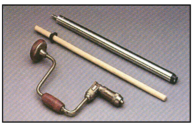
Figure 1. Hay corer

If using a hay corer or probe ( Figures 1 and 2 ), it must have a tip sharp enough to cut through the hay. It must have an internal diameter of at least 1 cm (3/8 inch), and it must be long enough to extend into the middle of a large round bale. When sampling a square bale, insert the corer into the middle of one end of the bale and drill into the middle of the bale ( Figures 2 and 3 ).