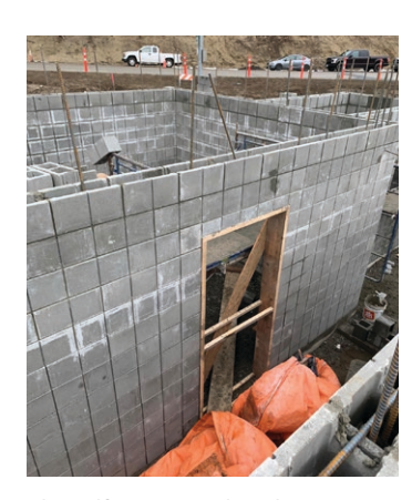
The Balfour terminal washrooms are nearing completion.

The tie-in from Upper Balfour Road to Highway 3A has been finished, and Upper Balfour Road has been reopened to traffic. Thank you to all the residents of Upper Balfour for their patience while we undertook this necessary work to realign the road and improve safety for road users.