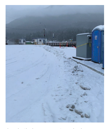
Stockpiled snow against the bus pad at Balfour.