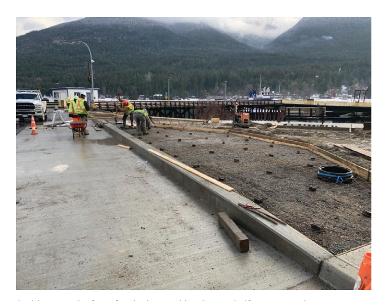
Building out the form for the bus pad landing at Balfour terminal.

At Kootenay Bay all roadworks at the terminal have completed. Renovations to the washroom and the new terminal attendant hut will be completed in early 2022.