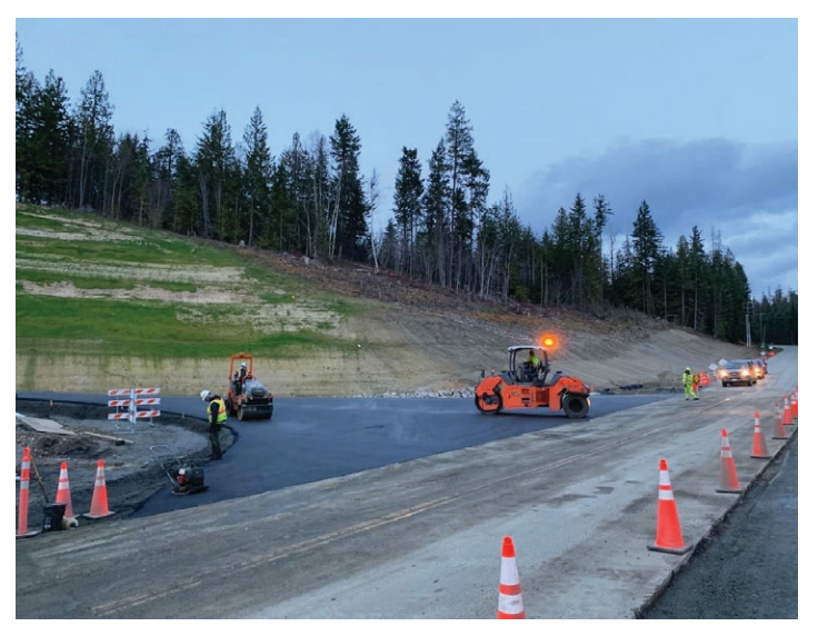
Paving the tie-in from Upper Balfour Road to Highway 3A.