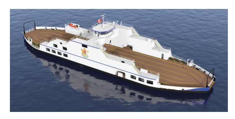
Artists rendering of the new electric-ready vessel.

Once the ship's hull has been assembled, the ship will be floated and remain moored near the shore where it can be outfitted with mechanical systems, electrical systems, control systems, interior components and finishes.