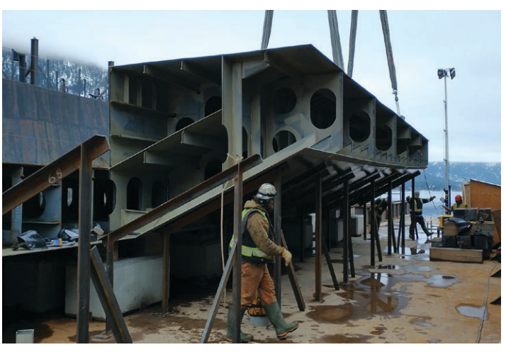
Engine room blocks are assembled in the drydock.

In line with the Province's aim to electrify 100% of its inland ferry fleet by 2040, the new vessel will be built with all the systems, equipment, and components for electric propulsion alongside diesel engines. By 2030, once shore power is in place and the technology has been tested for reliable daily use, a full conversion will be made from diesel to electric propulsion.