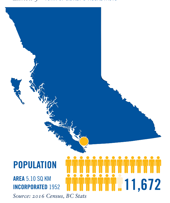
Exhibit 3 - TOWN OF SIDNEY'S VISUAL FACTS

44. The Town of Sidney was incorporated as a village on September 30, 1952. Sidney's geographic area is 5.10 square kilometres. In 2016, Sidney's population was 11,672 which represented an increase of 4.4 per cent from 2011. Almost 41 per cent of Sidney's population was aged 65 years or older. There were just over 5,900 private dwellings in the Town.