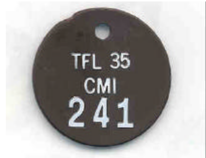
Figure 2. Tree tags used on the TFL 35 growth and yield monitoring sample plots (actual size).

We had special plastic tree tags made for this project (3.8 cm in diameter (1.5 in)). The tags were chocolate brown in color instead of the usual blue. This color was selected to help keep the tags as hidden as possible. The tags were numbered from 001 to 999 (Figure 2). These tags were made by T.B. Vets, Vancouver, BC.