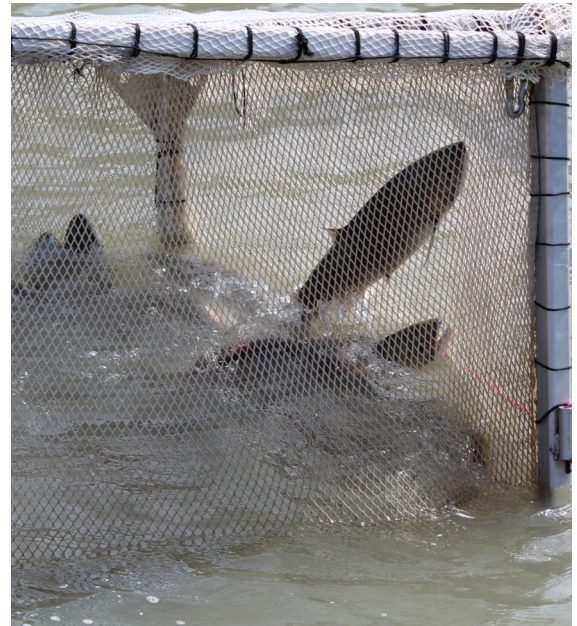
Salmon in a holding pen await helicopter transport.