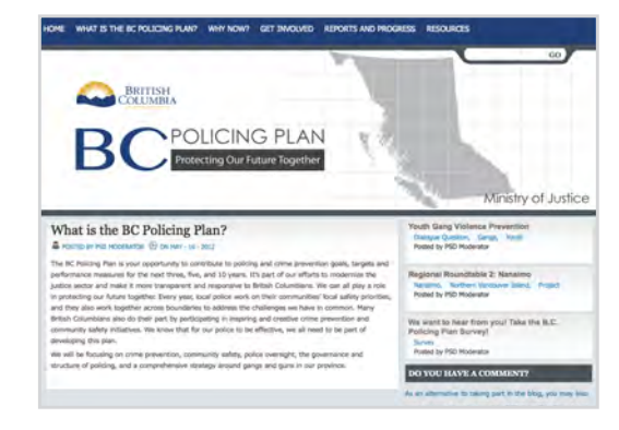
Figure 3 BC Policing Plan website

purpose of the B.C. Policing Plan blog site is to provide the public with a transparent view of how the B.C. Policing Plan is being developed and to extend the conversations started in the roundtables. The site also provides the public with a forum to respond to the ideas and suggestions being generated by the project.