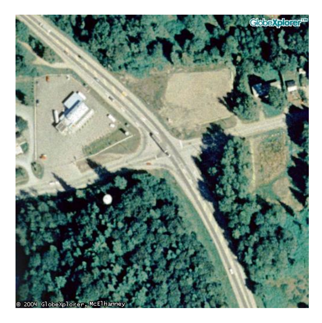
Exhibit 1-1 Highway 9 at Yale Road East

The project is located on Highway 0.56 km north of the Bridal Falls Overpass on Highway 1. Highway 9 is rural posted 60 km/hr with some commercial development near the intersection. Yale Road E. Intersects the highway at a 60 degree skew angle with a horizontal curve on Highway 9.