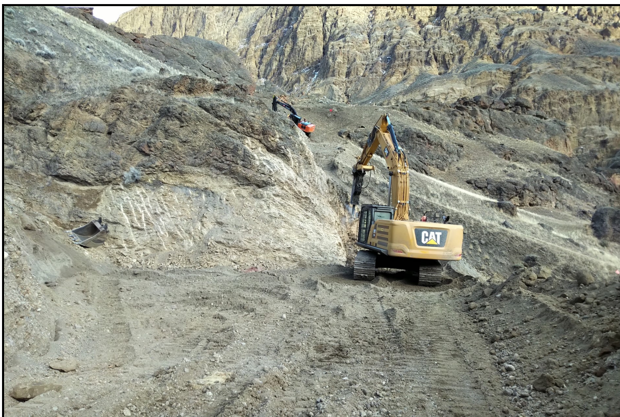
LEFT Access route construction Jan. 20, 2020