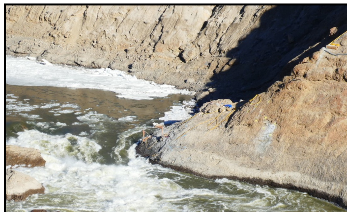
TOP AND MIDDLE: Overland access construction continues BOTTOM: View of the East Toe (Taken Jan. 29, 2020)