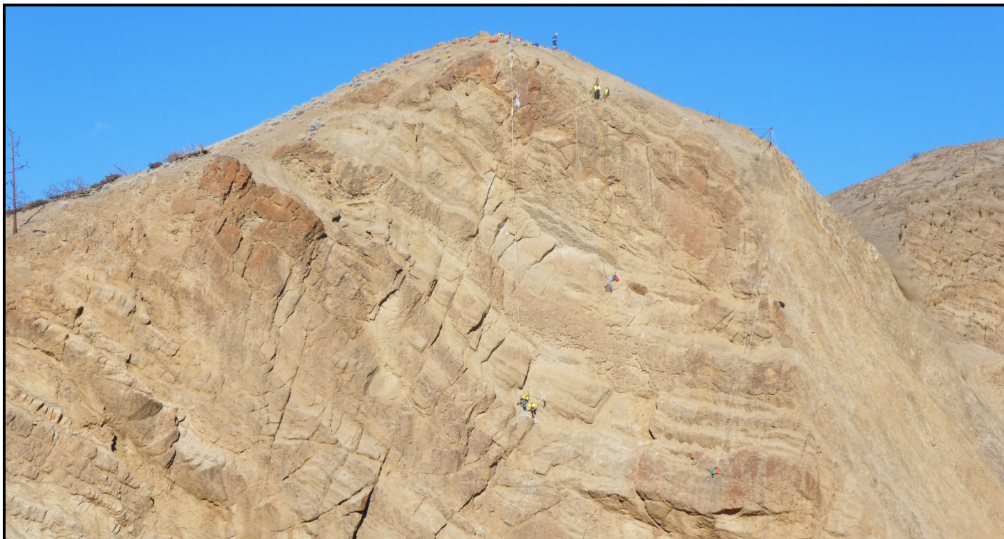
TOP Rock scaling Jan. 29, 2020