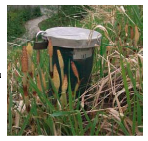
Contaminated flood waters can enter wells

• Do not bathe or swim in floodwater. It may contain harmful organisms.