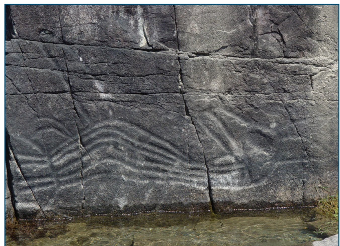
Photo 3. Carved by the Ancestors of the Hupacasath people. These unique supernatural creators were grooved into the rock face by possibly using sharpened sticks and wet sand as an abrasive.