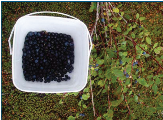
Photo 1. Huckleberry ( Vaccinium membranaceum ) harvesting

Plants (including trees and understorey plants) have been used for cultural purposes by First Nations peoples for millennia. Uses include sustenance, medicines, spiritual uses, and materials (e.g., fibres and building materials). The continued use of plants for cultural purposes is of critical concern to most, if not all, First Nations.