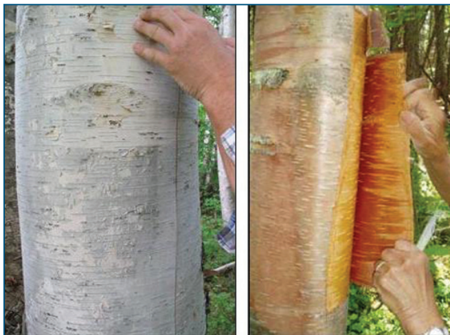
Photo 2. Birch ( Betula spp. ) bark harvesting.

Many tree species are of critical cultural importance to First Nations throughout British Columbia (e.g., birch [ Betula spp. ], aspen [ Populus tremuloides ], lodgepole pine [ Pinus contorta ], balsam [ Abies spp. ], willow [ Salix spp. ], and black spruce [ Picea mariana ]) (Parish et al. 1996; MacKinnon et al. 1999).