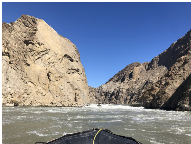
Almost 14,000 salmon swam past the landslide on August 31.