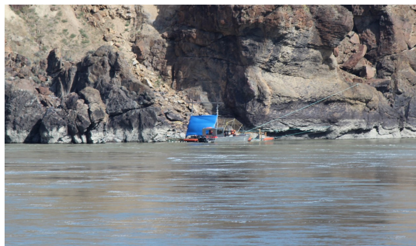
The first fish wheel is back in operation after being repositioned.