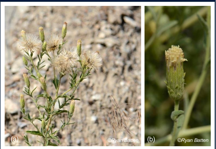
Figure 6 Close-up of (a) irregularly open inflorescence and (b) single elongate flower head composed only of disk flowers