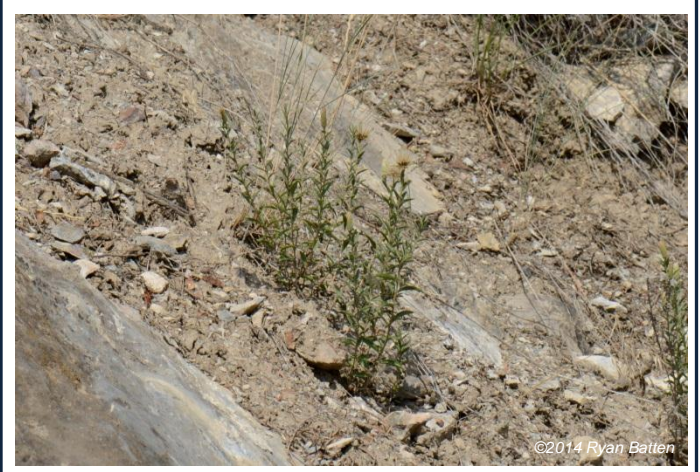
Figure 3 Dry, steep rocky slope with abundant exposed substrate