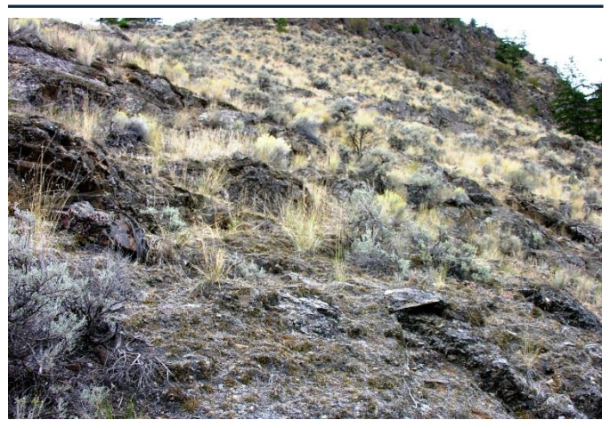
Figure 2 Dry, rocky slope in grassland shrub-steppe habitat near Keremeos, B.C.