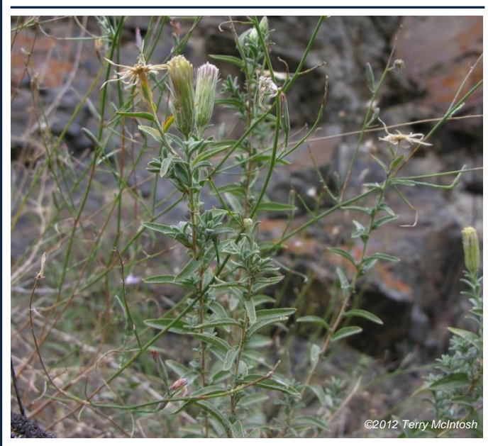
Figure 5 Flowering plant with typical grey-green leaves and stems

Achenes containing seeds, 4 to 6 mm long, 10ribbed, glandular to glandular-hairy, with numerous white bristles (pappus) at their tips