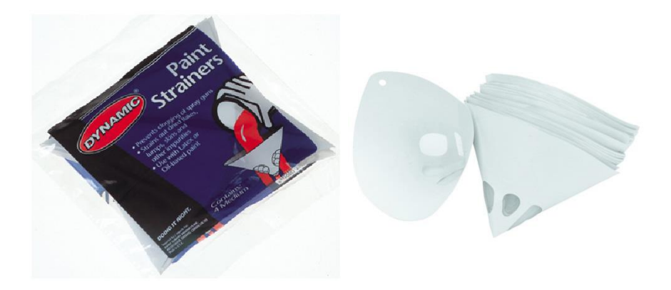
Figure 2 – examples of paint filters that will work for mass trapping efforts