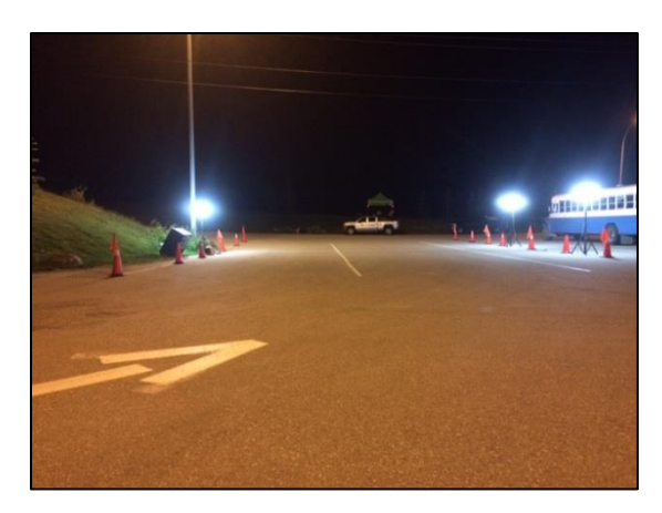
Nighttime operations at the Golden inspection station.