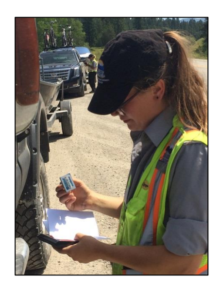
BC-AB Joint Passport being issued by one of the Cranbrook Inspectors.