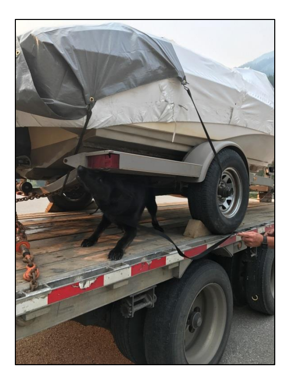
Kilo inspecting a commercially hauled watercraft from Ontario at the Golden inspection station.