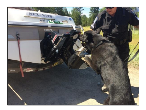
Kilo the mussel detection dog is now touring inspection stations.