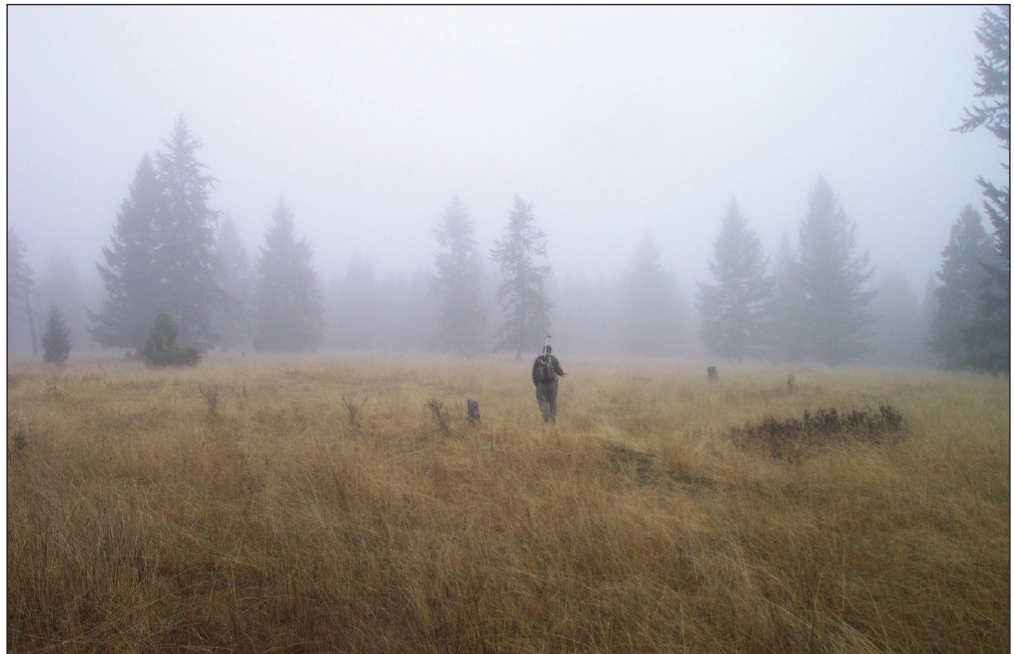
Badger wildlife habitat