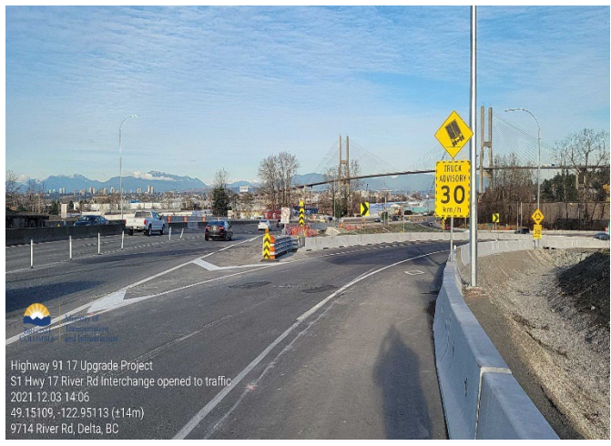
S1: Hwy 17 River Road Interchange opened to traffic. Taken December 3, 2021