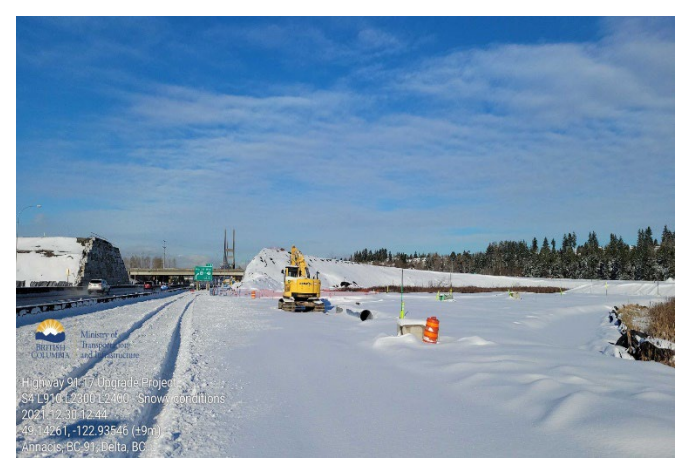
S4: Snowy conditions. Taken December 30, 2021