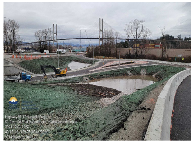
S1: River Road east roundabout - hydroseeded slopes. Taken December 1, 2021