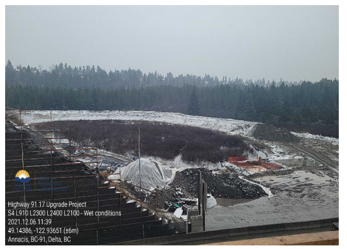
S4: Wet conditions on site. Taken December 6, 2021