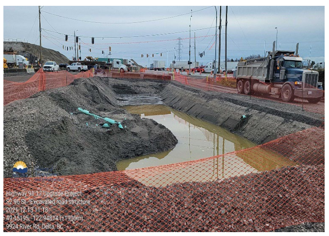
S2: 96<sup>th</sup> Street excavated road structure. Taken December 13, 2021