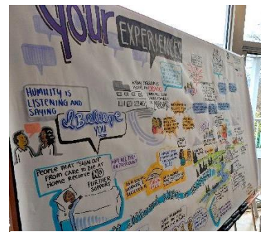
Graphic Recording of participants' responses to the terminology of 'cultural safety and humility' to identify gaps or concerns as well as document participants experiences.

Background: The B.C. Ministry of Health's Patients as Partners Initiative hosted a series of Regional Engagement Tables throughout British Columbia, and a final, provincial round-up meeting in 2018. The purpose of these events was to gather information to help both community and provincial health leaders when they develop new policies and strategies on health-care improvements. As part of this series of engagement tables, representatives from Patients as Partners, the First Nations Health Authority and the Provincial Health Services Authority worked together to host a full-day workshop on February 5, 2018, in Vancouver. There were 38 participants, including patients, family caregivers, health-care providers and health-care administrative staff. The workshop provided a culturally safe space where Aboriginal peoples living in urban areas could come together with health-care staff to discuss what cultural safety and humility means to them and what can be done to improve these key components of health care.